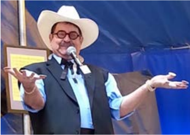
Brad's World Reptiles