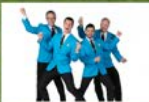
The Diamonds Aug 5 @ The Fair