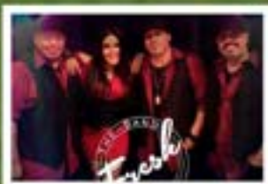
The Band Fresh July 28