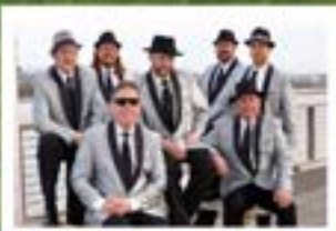
High Street Band August 11