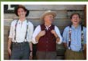
Rock Bottom Boys July 21