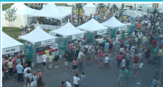
Des Moines Arts Festival, 2007