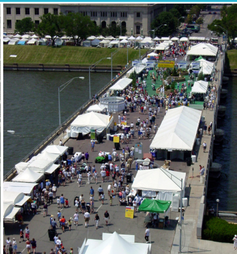
Des Moines Arts Festival, 1998