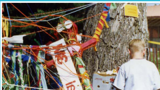
Art in the Park

After 40 years behind the Des Moines Art Center, Art in the Park moved downtown in 1998 and changed its name to Des Moines Arts Festival.