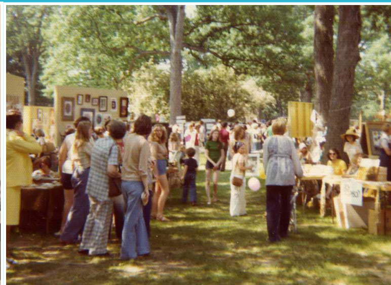
All Iowa Art Fair