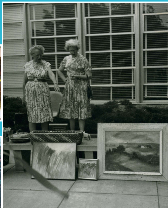
Iowa Artists Exhibition