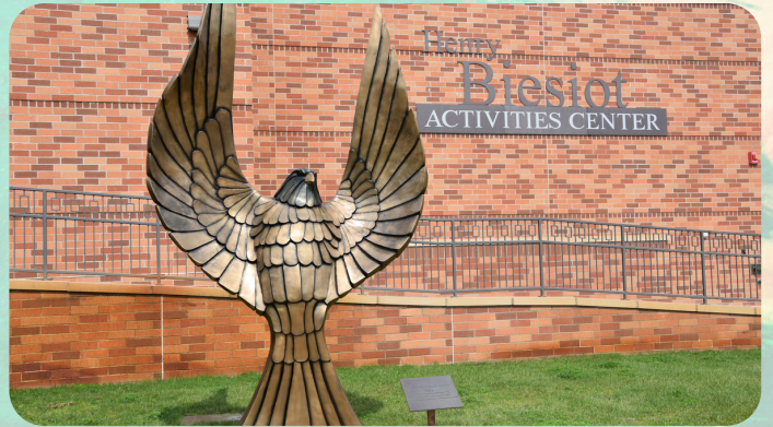
"Forever a Blue Hawk"