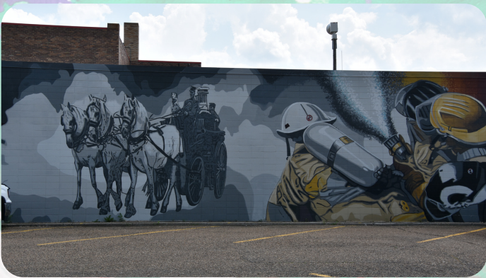
"To Serve With Honor"

Guillermo Ivan Avalos - 2016 161 South Main Avenue