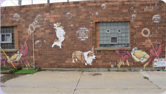
"Corgis and Crabs"