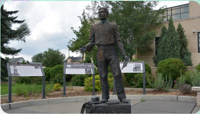
"Young TR Enters the Arena"