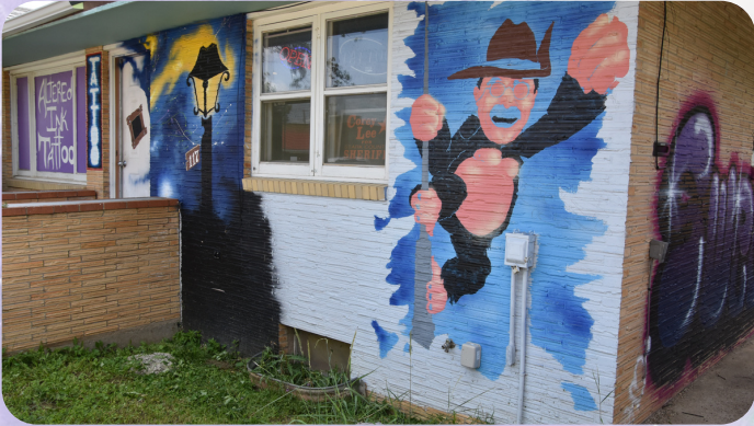
"Altered Ink Tattoo"