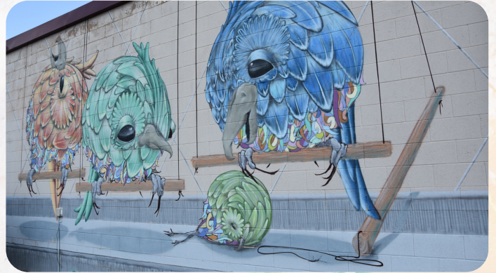
"Why the Caged Bird Weeps"