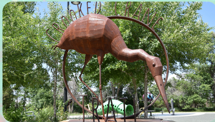
"Crooked Crane Trail"