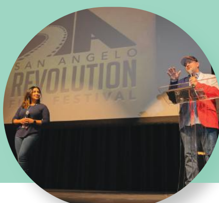
San Angelo REVOLUTION Film Festival