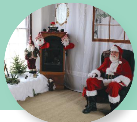
Christmas at Old Fort Concho