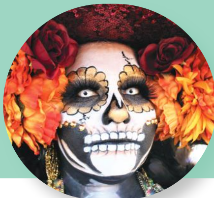
Dia de Los Muertos Celebration