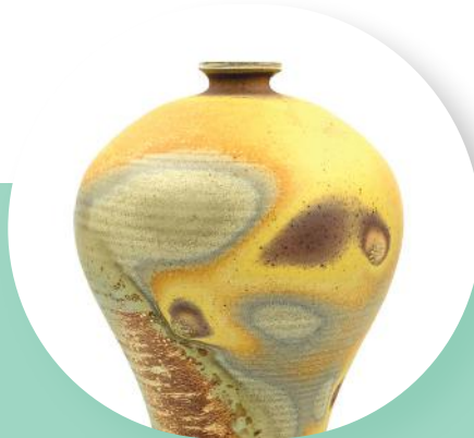
San Angelo National Ceramic Competition