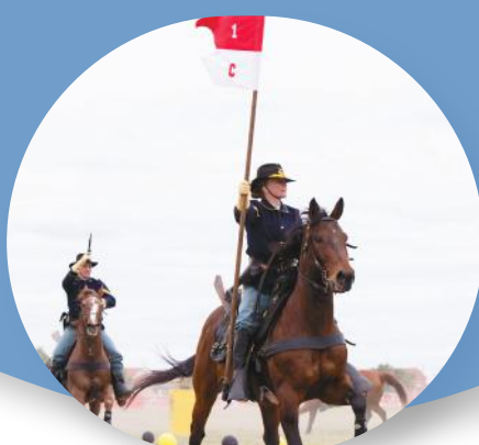
Fort Concho National Historic Landmark