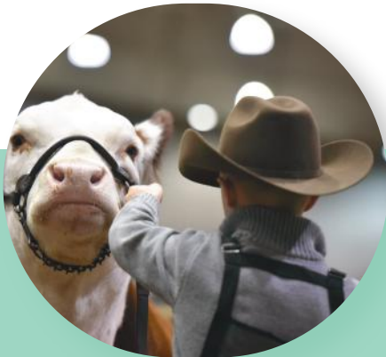
San Angelo Stock Show & Rodeo