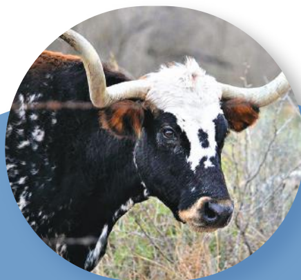
San Angelo State Park