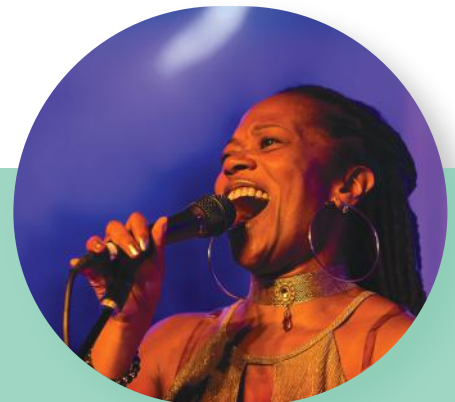
Simply Texas Blues Festival