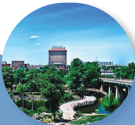
Celebration Bridge in Downtown San Angelo

Located along the Concho River, the San Angelo Visitor Center welcomes visitors upon arrival to the city and provides a rest area and information point for travelers. Quarried from local limestone, the serpentine structure is the most photographed area in San Angelo, with access to San Angelo's River Walk and pedestrian pathways to the historic city center.