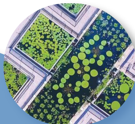
International Waterlily Collection