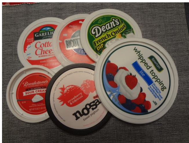
Cottage Cheese, Sour Cream & Cool Whip Container Lids