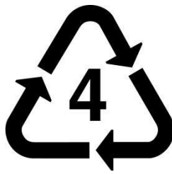
LDPE Low Density Polyethylene