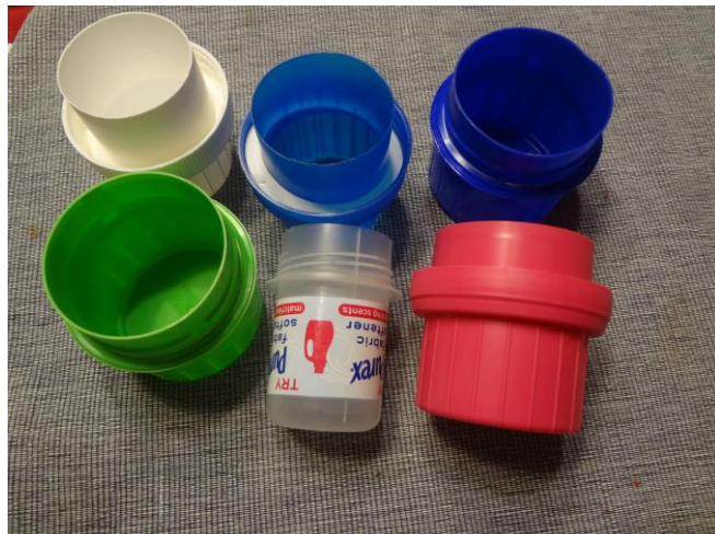
Detergent Caps with white gasket and label removed