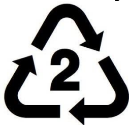
HDPE High Density Polyethylene

With all of the acceptable caps and lids listed above, we also accept caps and lids with correct recycle numbers on them of 2 4 or 5 that are under 8" wide