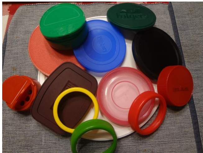
ice Cream Bucket, Misc Lids under 8"