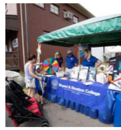
On Site Activation