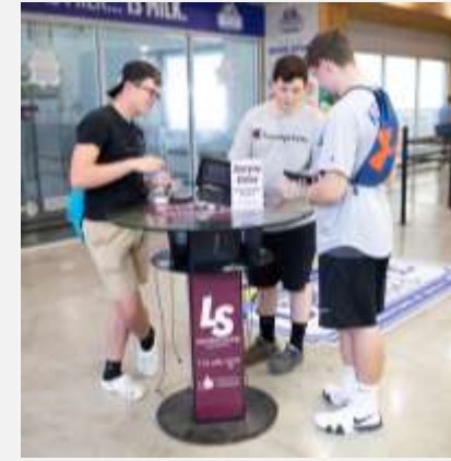
Branding with services