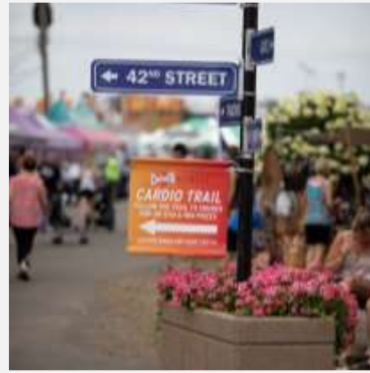
Custom Directional Signage