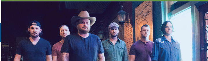
RANDY ROGERS BAND