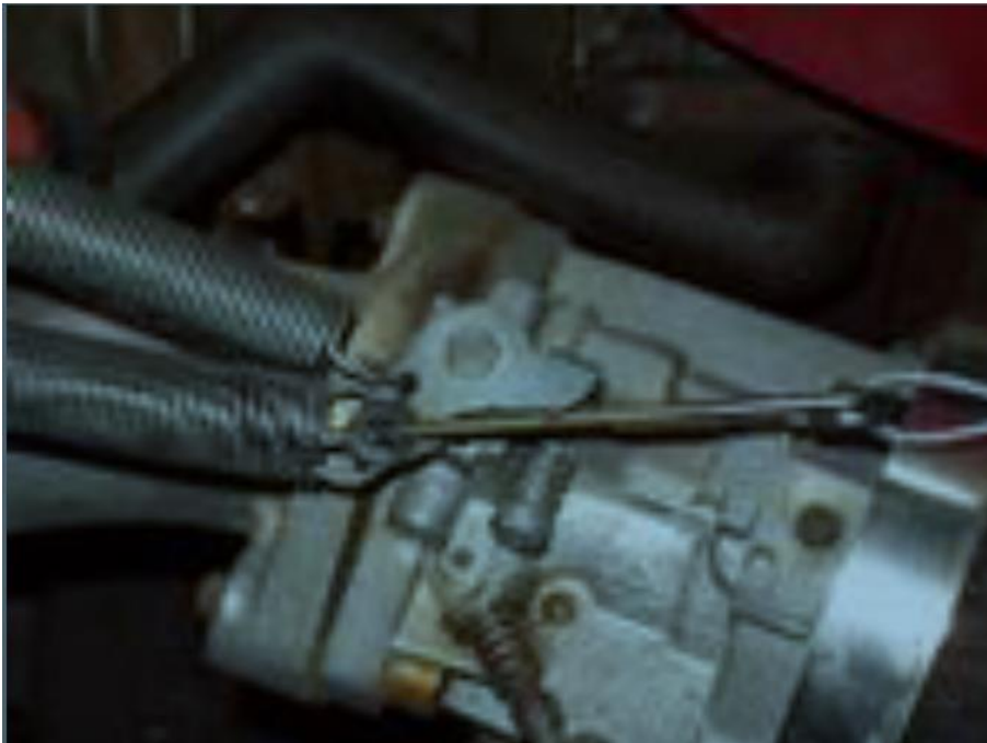
Photo 1: This is the correct way to attach the throttle return springs on the carburetor Notice they are mounted on two different Locations and not together;

H.) All mowers in all classes be fitted with sturdy double return springs mounted at two different mounting points on both ends to help eliminate throttle from sticking or failure to completely close when released. Below are two photos to help understand these precaution measures: (these are just some examples of the intent)