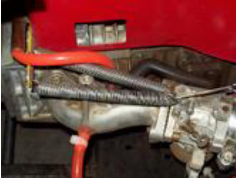
Photo 2: Notice that the springs are attached to the same bracket this is incorrect! They must be mounted on two separate mounting brackets. This way if for any reason one breaks you will still have one spring attached. For V-twins and different style carburetors used on FX's, the same principle must be used. For example, FX's using Mikuni, or the CV style Keihin Carburetors the Slide Spring can count as one return spring and you must have a separate external spring attached as the safety spring.

H) FRAME: Discrete strengthening is allowed. Front and rear axles must use original frame as primary mounting point.