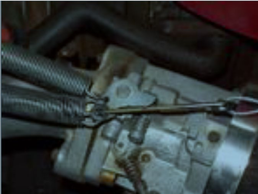
Photo 1: This is the correct way to attach the throttle return springs on the carburetor. Notice they are mounted on two different Locations and not together.