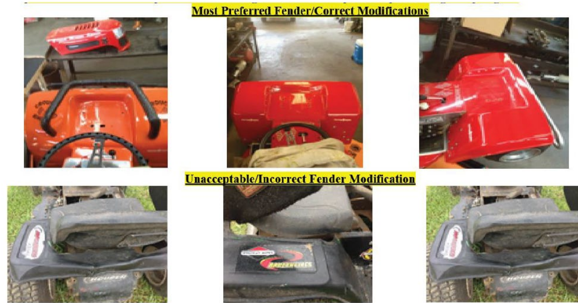
If in doubt, it is best to check with the National Tech Inspector Or National Chief Steward for further clarification.

cc) FUEL and FUEL DELIVERY: The only acceptable fuel is pump gasoline. Additives, other than STABIL Fuel Stabilizer are prohibited. Any apparatus other than the carburetor which can be used to introduce any gaseous or liquid substance into the induction flow, whether connected or not, is prohibited, and will result in disqualification. Such devices include, but are not limited to, Nitrous Oxide, alcohol or water injection systems, turbo or superchargers, and/or the attendant hardware consistent with these systems. Any attempt to conceal or disguise such apparatus will be considered a flagrant violation and may result in expulsion. Electric fuel pumps are not allowed.