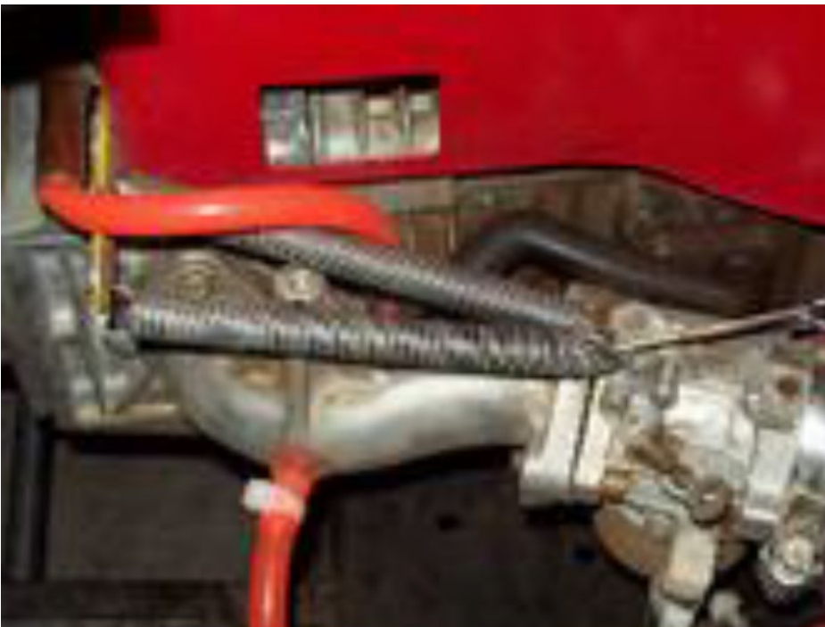
Photo 2: Notice that the springs are attached to the same bracket this is incorrect! They must be mounted on two separate mounting brackets. This way if for any reason one breaks you will still have one spring attached. For V-twins and different style carburetors used on FX's, the same principle must be used. For example, FX's using Mikuni, or the CV style Keihn Carburetors the Slide Spring can count as one return spring and you must have a separate external spring attached as the safety spring.