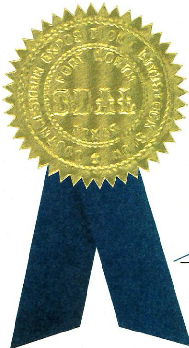
LIVESTOCK SHOW MANAGER

SPONSOR 4321 Main Street Fort Worth, TX 76101