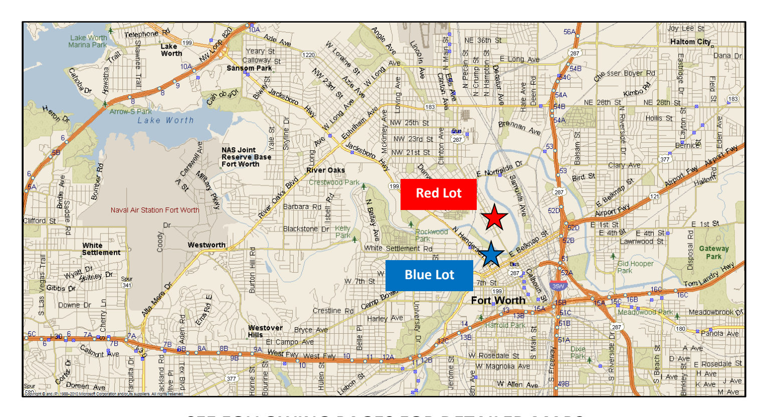
SEE FOLLOWING PAGES FOR DETAILED MAPS