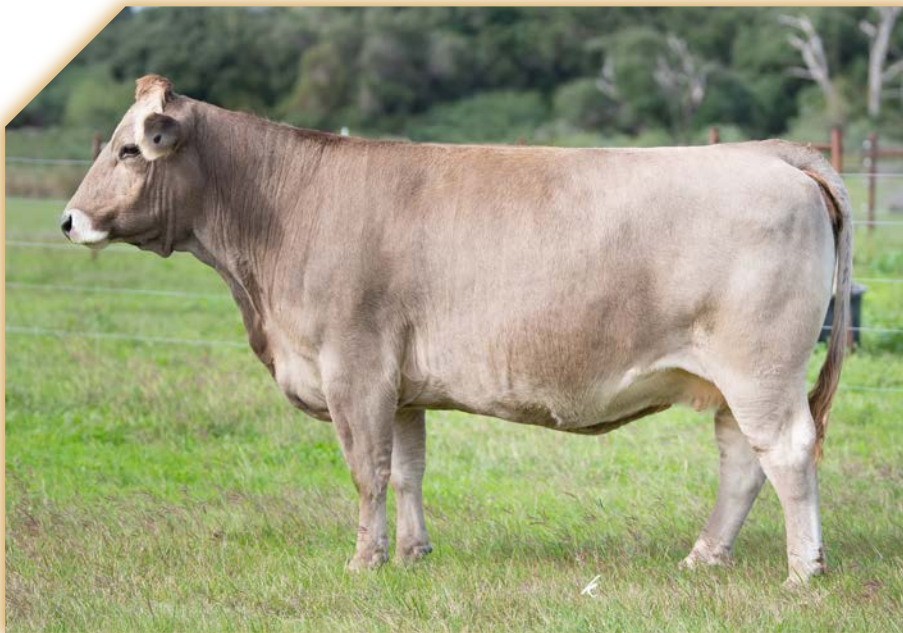
MISS HLJ GOLDEN ROSE ET | GRANDDAM OF LOT 18