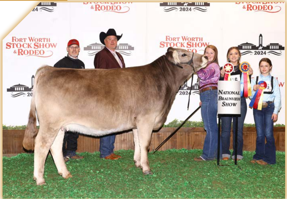
MISS JMS BETH K312 | PATERNAL SIB TO LOT 17