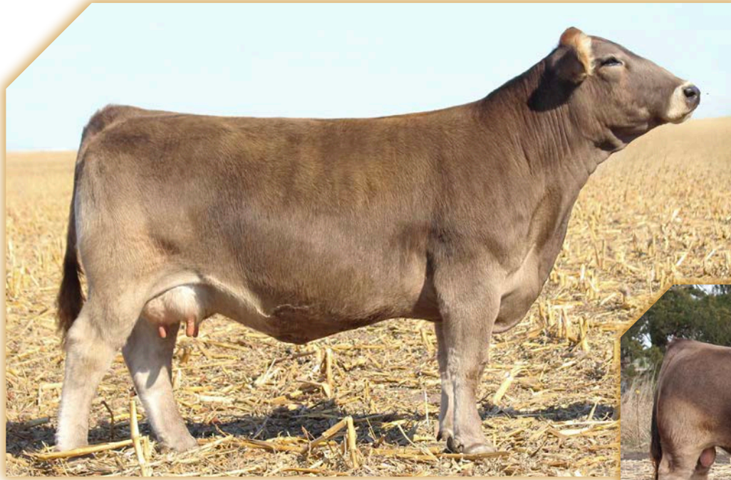
WCCR DIXIE DARLIN 0068 | FLUSH SELLS