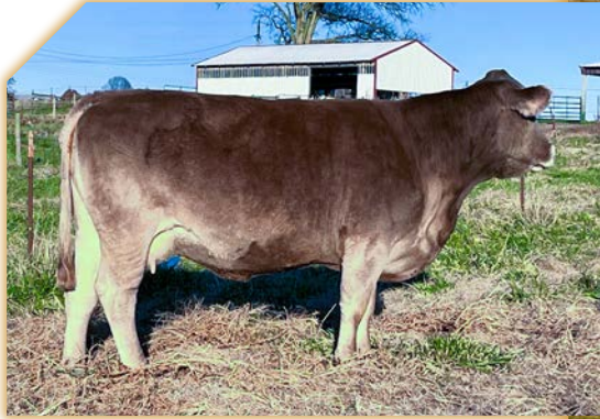
WW FIELDSTONE JASMINE 229Z ET