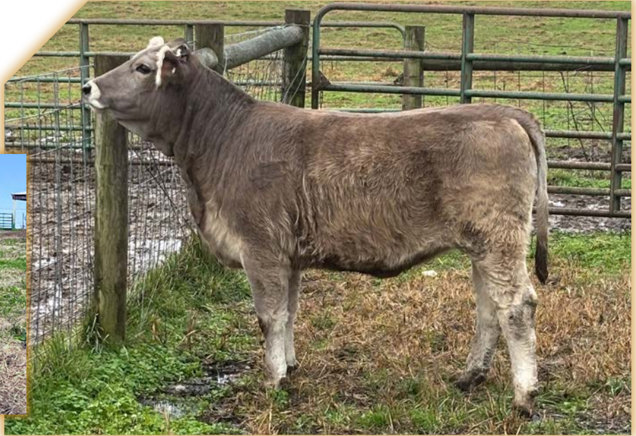
LOT 21 | HALF SIB TO LOT 22