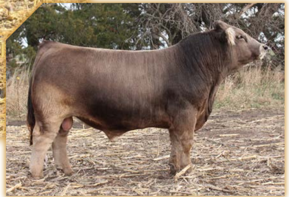
WCCR GRINDSTONE 3120 | SON OF WCCR DIXIE DARLIN 0068