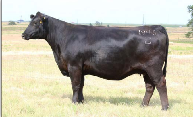
G A R SUNRISE 1946 - DAM OF LOT 1

Owned by Wink Farms Frank and Mike Wink are offering 1/2 interest with the option to double the price and get full ownership in a proven donor who is currently the number one dam in the breed for $Combined. 1001 offers an unmatched set of numbers and comes from a highly influential Wink donor that has left a lasting impact on their program. This female posted impressive Method Genetics scores in the top 18% for MPI, 1% for QPI, and 3% for ROI. She has averaged 4.2 embryos on 4 flushes and sells due to calve April 17 to G A R Home Free.