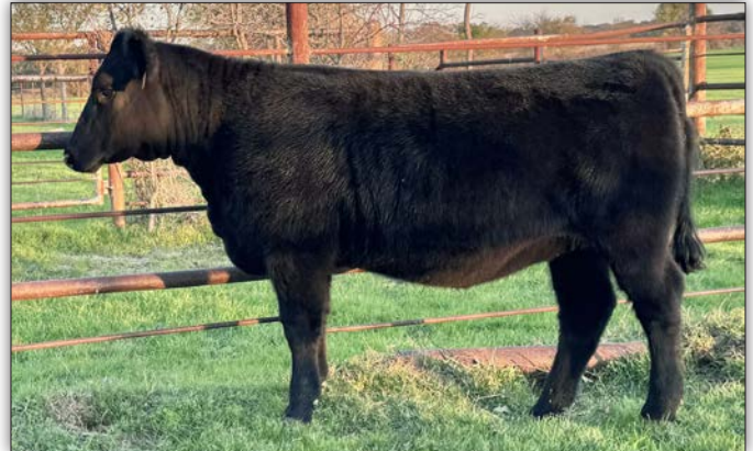
MASSIES FRONTIER GAL 2305 - LOT 15A