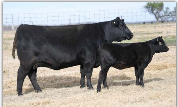
BROWN MS REVOLUTIONARY 706J - LOT 22

Check out the donation heifer on page 1 and be sure to bid to support the Texas Junior Angus Association on Saturday, January 20.