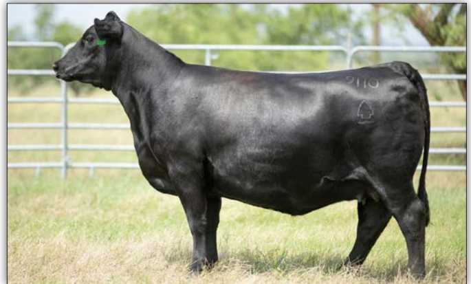
PAR LADY 9110 - LOT 25

Owned by Encore Cattle A top-producing Ramesses daughter, Lady 9110 has a production record of 2 at 93 for birth and 106 for weaning with 1 at 105 for yearling and 102 for IMF. Her last calf posted an actual birth weight of 60 pounds and an adjusted weaning weight of 777 lbs in our harsh West Texas climate. She will sell with a calf at side by Rocc Top Game 822, due December 19.