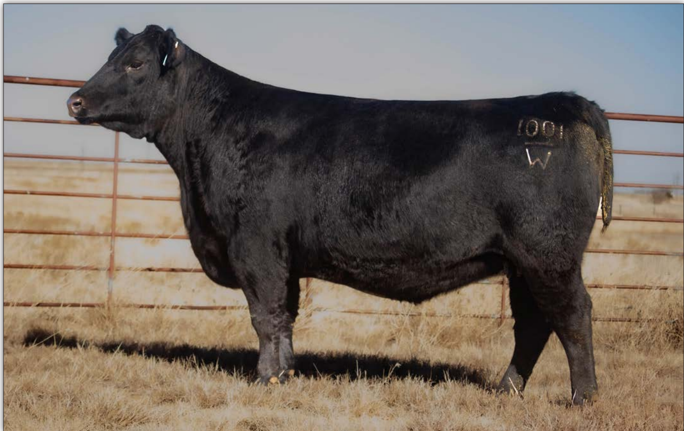
BAR W FIREBALL 1001 - LOT 1