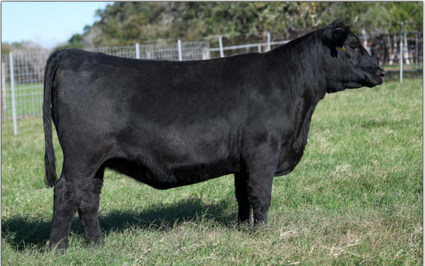
2BARC BREAKTHROUGH 2103 - LOT 30

Owned by Robinson Brothers Farm Another powerfully-made Veracious daughter, Rita K145 offers added growth and carcass merit and stems from a highly-proven and predictable cow family. She will be bred to SEO VVA New Paradigm.