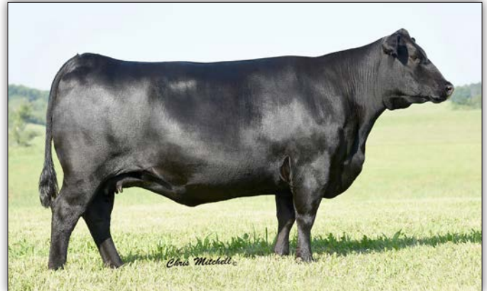
E W A 3114 OF 128 WEIGH UP - DAM OF LOT 43