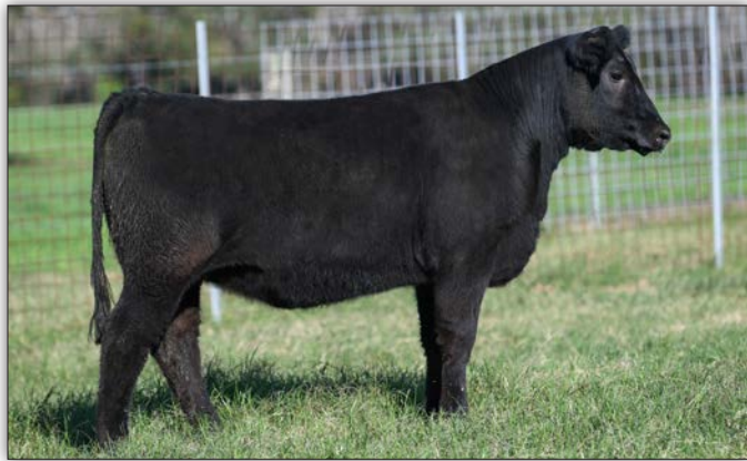
2BARC 9503 3003 - LOT 9

Owned by 2 Bar C Cattle Company A daughter of the 2BarC and Stratford AI/Herd Sire, SS Alternative 9503, who has proven to be an excellent outcross choice in the 2BarC AI/ET program. This female offers elite numbers across the board with a huge growth spread, and elite carcass merit that leads to six $Value Indexes in the top 2%.