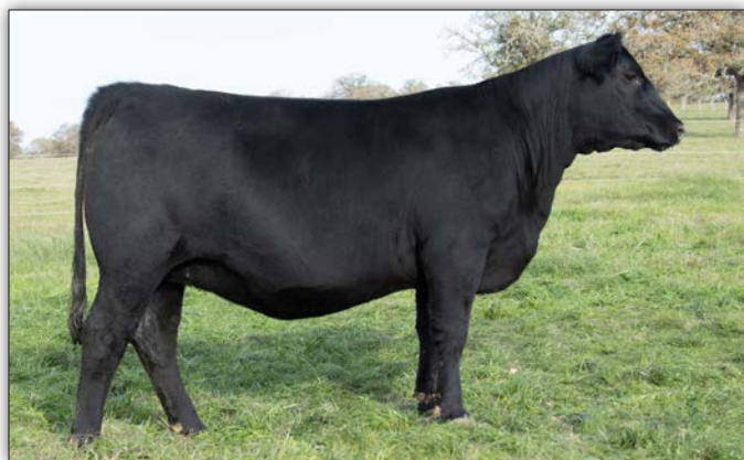
RMRK MY LADY 2239 - LOT 37

Owned by B4L Angus Our keeper pen ran deep this year, but we still wanted to bring one of our best. I may regret letting this one go. The cow family she comes from is a phenomenal bull producer. They are always the first bulls chosen by our commercial producers. Her first bull will pay for her purchase. She was bred to calve September 20 to Connealy Craftsman.