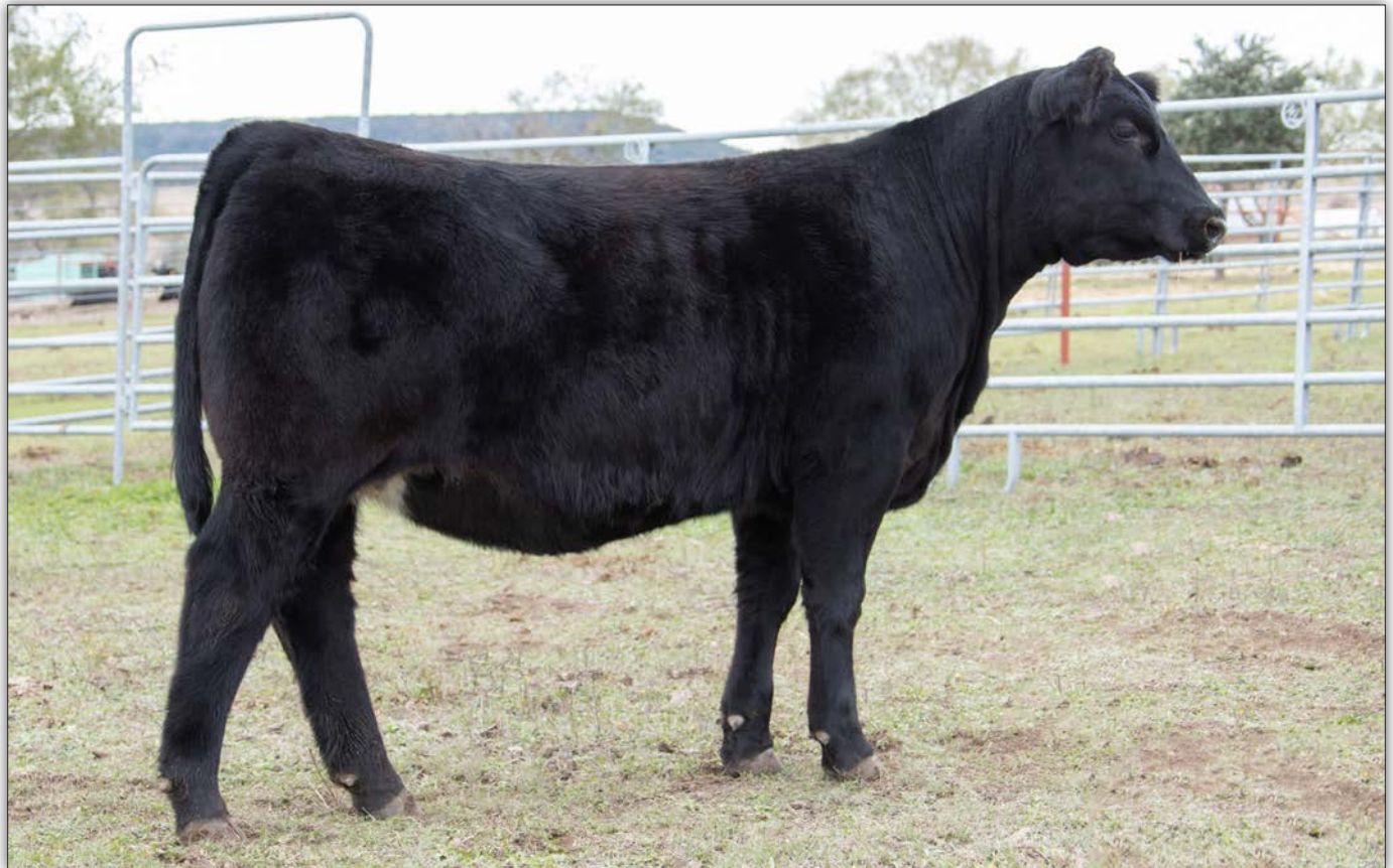
PAR RITA 2414 - LOT 11

Owned by Peary Angus Ranch A super sound-made female that is a full sister to the $70,000 valued ORigen sire, PAR Ares, coming from the cornerstone Peary Angus donor, Rita Y05C 4107, who has produced over $280,000 in progeny sales and is a direct daughter of the $1 million producer, Rita 27R Y05C. This female is loaded with elite performance and elite genetic combination. She possesses 17 different traits in the top 20% of the breed.