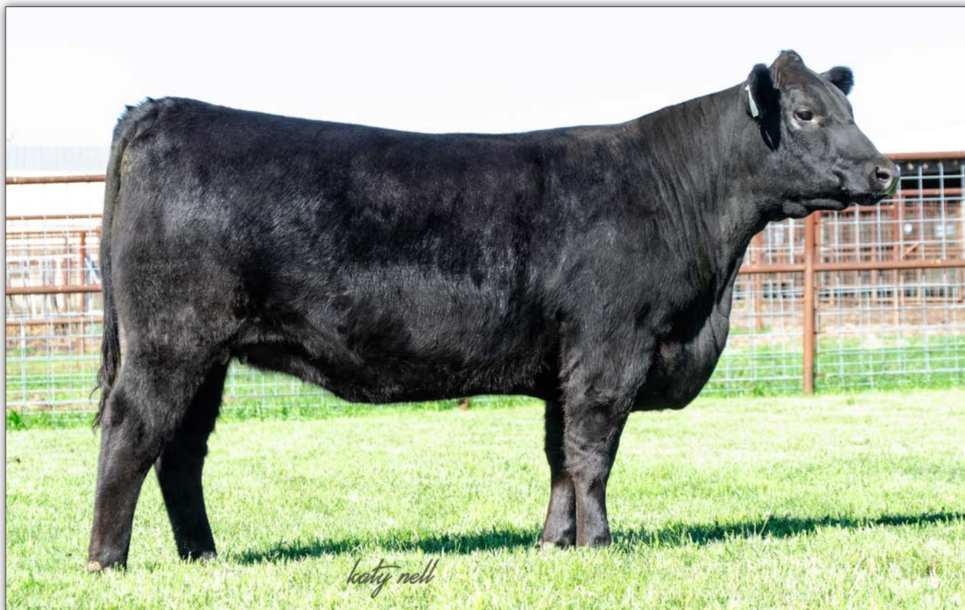
LCC HOLLYWOOD ASCEND 2424 - LOT 26