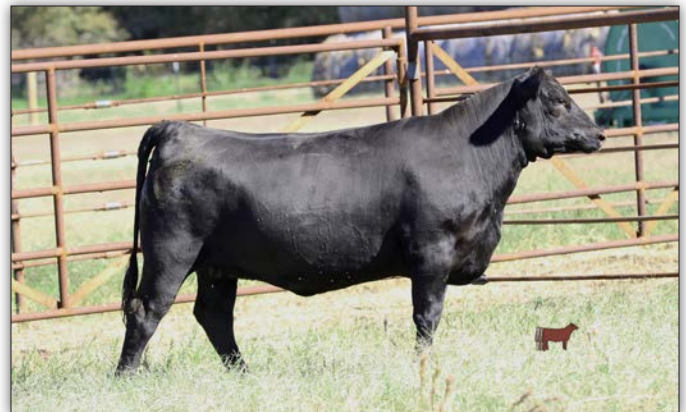
SJH HOME TOWN OF 1039 2713 - LOT 34B

Owned by Hillhouse Angus The second of two flush sisters that stem from the $300,000 G A R Objective 2345 through their famous dam who has produced over $250,000 in the Hillhouse and Peary programs. 2713 posted individual ratios of 93 for birth, 105 for weaning and 109 for ribeye, and offers elite calving ease with a nice growth spread and impressive carcass merit.