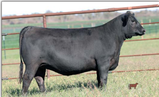
SJH HOME TOWN OF 0724 2709 - LOT 33

Owned by Hillhouse Angus 2709 represents the famous Blackbird family and posted individual ratios of 103 for birth and weaning, 124 for IMF and 107 for ribeye, to help place her in the top 2% for $Grid, as well as top 3% for $Beef and Marb EPD. This female offers elite calving-ease potential to go along with her impressive carcass merit.