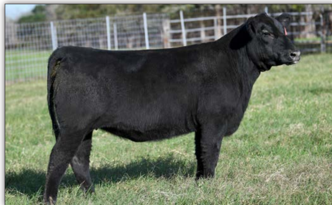
B&B PRIMETIME 3PT2 - LOT 3