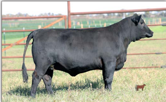
SJH HOME TOWN OF 5922 2726 - LOT 32

Owned by Hillhouse Angus This bigger RE Home Town daughter stems from the multi-million dollar producer, Rita 6108, and posted individual ratios of 114 for weaning, 101 for IMF, and 107 for ribeye, to help place her in the top 1% for RE EPD as well as top 4% for $Beef and $Combined.