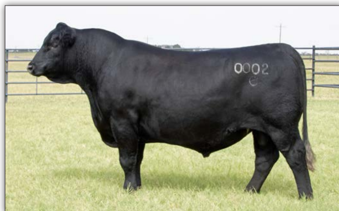
EAR PRIME TIME 0002 - SIRE OF LOT 3