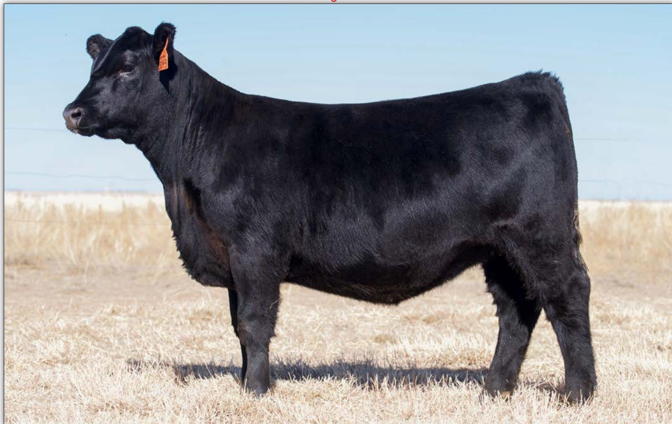
SV CATTLE ABLE 3043 - LOT 2