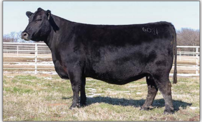
PAR BARBARA 6031 - DAM OF LOT 23