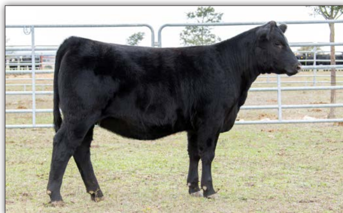
PAR BLACKCAP 3489 - LOT 8