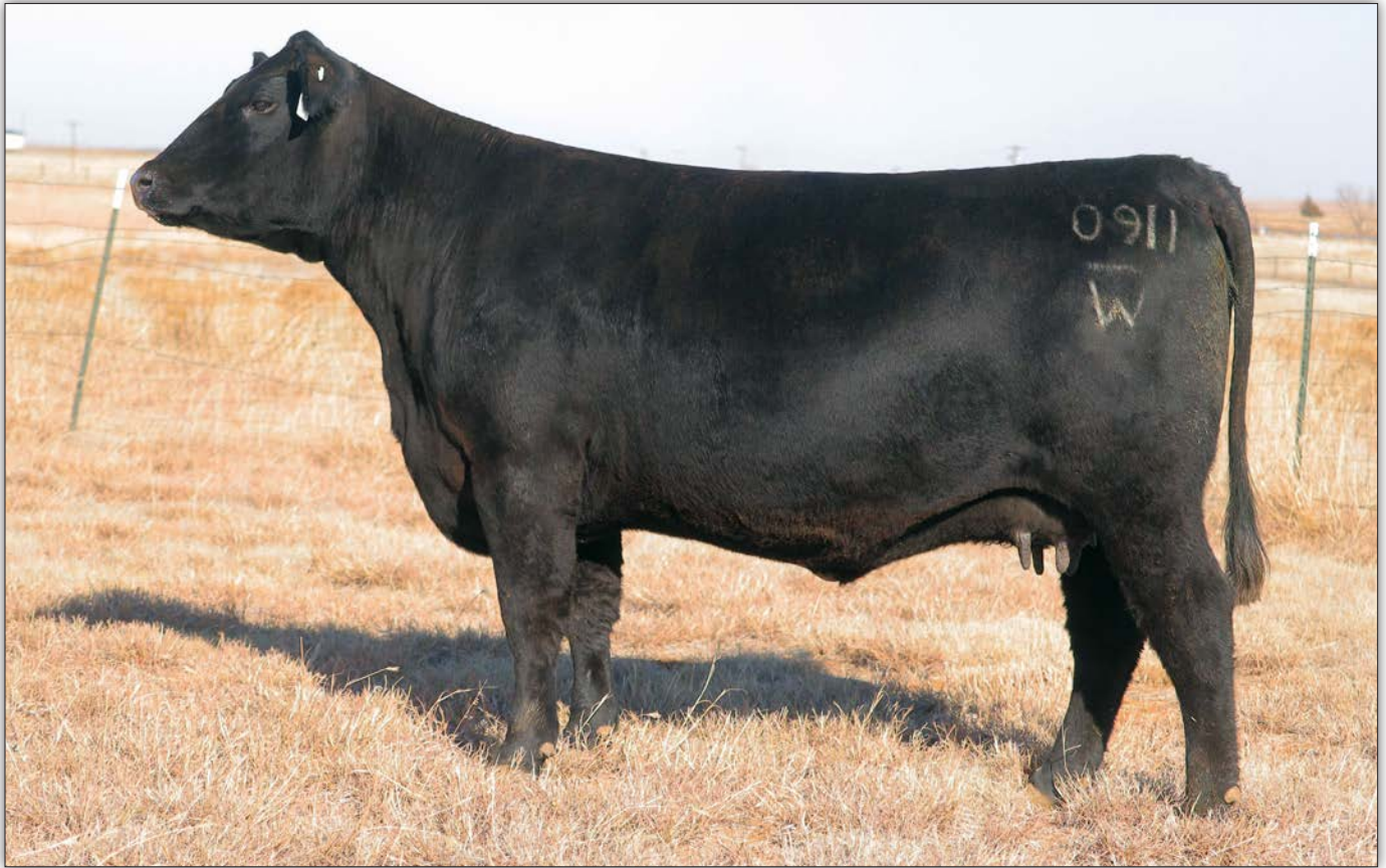
BAR W COMBUSTION 0911 - LOT 19