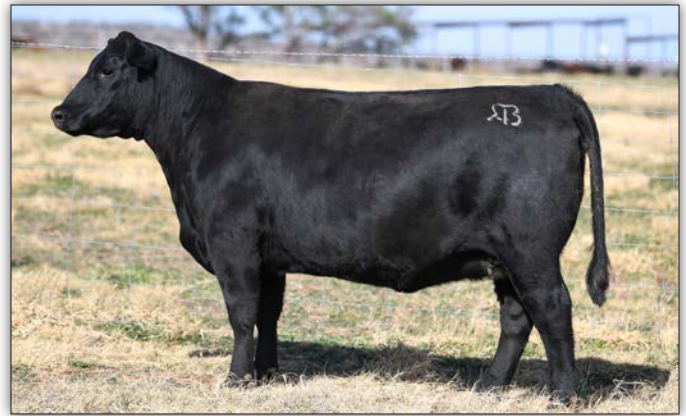
BROWN MS CONFIDENCE 726K - LOT 46

Owned by RA Brown Ranch The dam and granddam had 8 sons at last year's R.A. Brown Ranch October sale that sold for a total of $112,432. This cow traces back to a strong maternal foreign Angus herd book and the famous Brown Ms AbiGrace L7730 matriarch of the R.A. Brown Ranch that produced over $2 million in progeny sales. She produced through 16.5 years of age, her dam through 15.5 years, and granddam through 17.5 years of age. This is a great way to bring in some new outcross genetics with maternal strength and amazing longevity. She is due to calve March 8, 2024, to an outstanding Fireball son that sold for $10,000 in the RAB sale, Brown Fireball 289K.