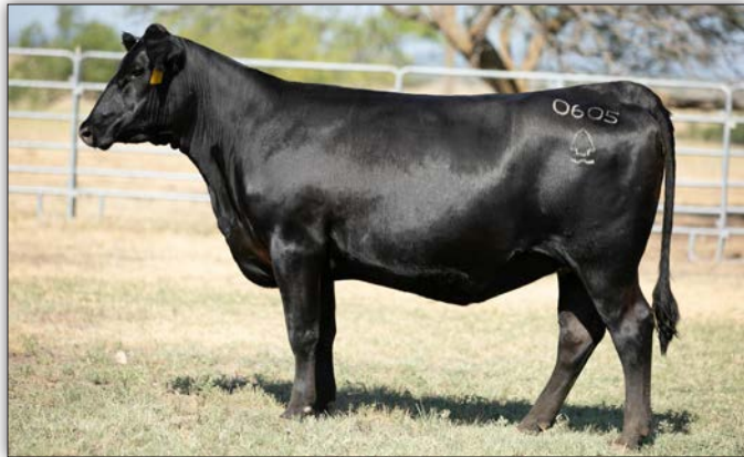
PAR LADY JAYE 0605 - LOT 49

Owned by Robinson Brothers Farm Lady Jaye 0605 is a top-performing Fireball daughter that posted impressive ratios of 94 for birth, 108 for weaning, 107 for yearling, and 121 for IMF, to be part of her Pathfinder dam's production record of 3 at 93 for birth with 4 at 110 for weaning, 3 at 105 for yearling, and 5 at 110 for IMF. She is due to calve February 3, 2024, to HPCA Veracious with heifer-sexed semen.