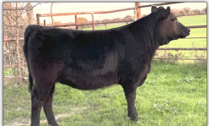
MASSIES FRONTIER GAL 2306 - LOT 15B