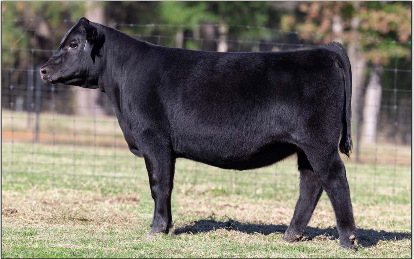
SPRUCE MTN WITCH 3039 - LOT 5