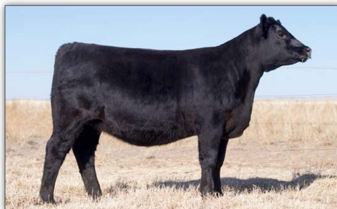
2 BAR TRANSCENDENT 3001 - LOT 4B