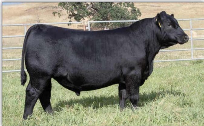
BYRD FAULT FREE 6276-2531 - LOT 16

Owned by Rimrock Production The Fault Free Group is offering an opportunity to acquire semen on the extraordinary $159,000 valued, Byrd Fault Free 6276-2531 He is the only non-parent sire in the entire database with his unique combination of WW, YW, SC, PAP, CW, Marb, RE, $B and $C. A direct son of the legendary multi-million dollar producer, MCC SuperMama 6276, he is a full brother to the $300,000 valued Byrd SuperMama FB 6276-2548, the $110,000 valued Byrd SuperMama FB 6276-2560, and the $42,500, Byrd SuperMama FB 6276-2554.