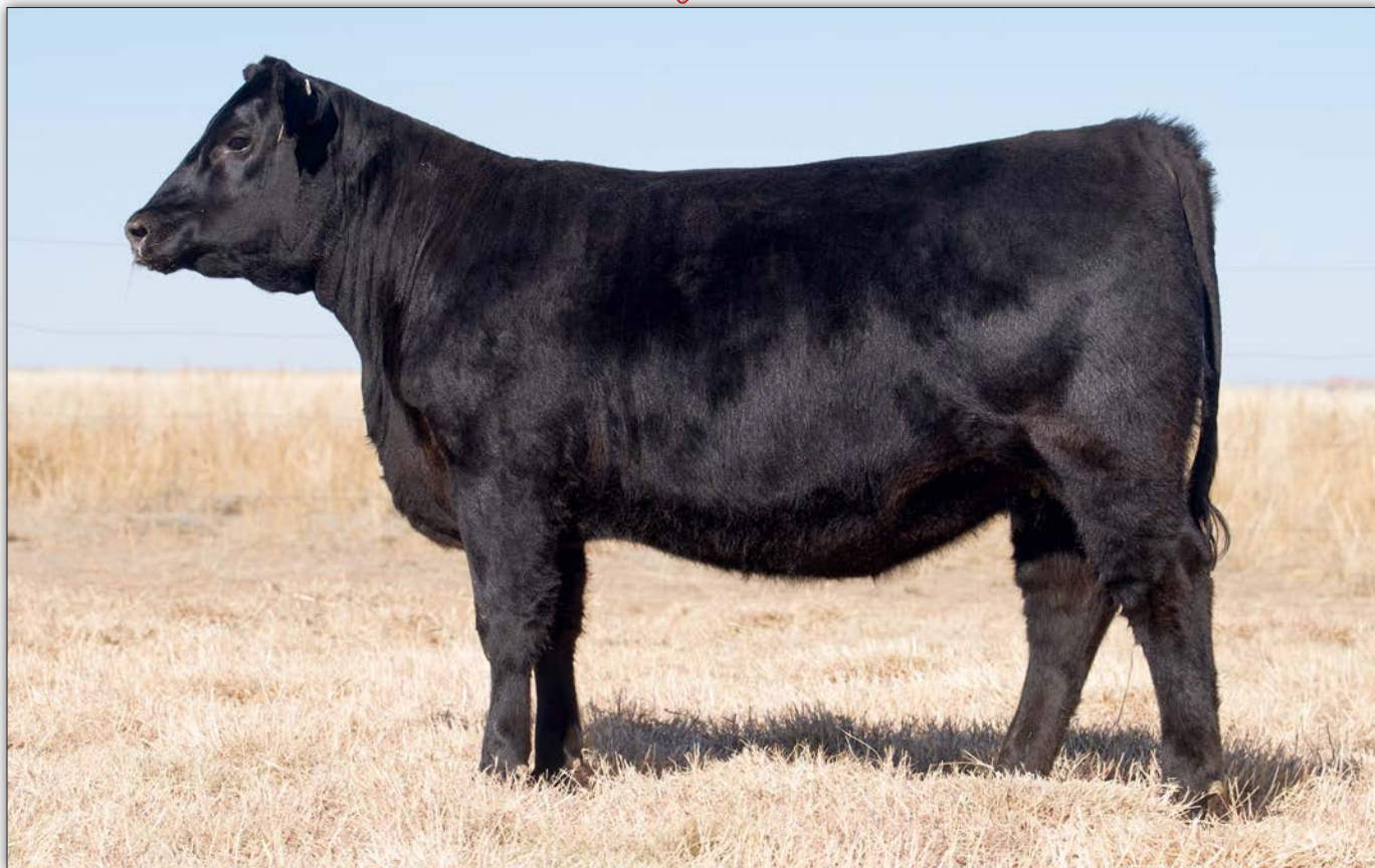
2 BAR TRANSCENDENT 3030 - LOT 4A