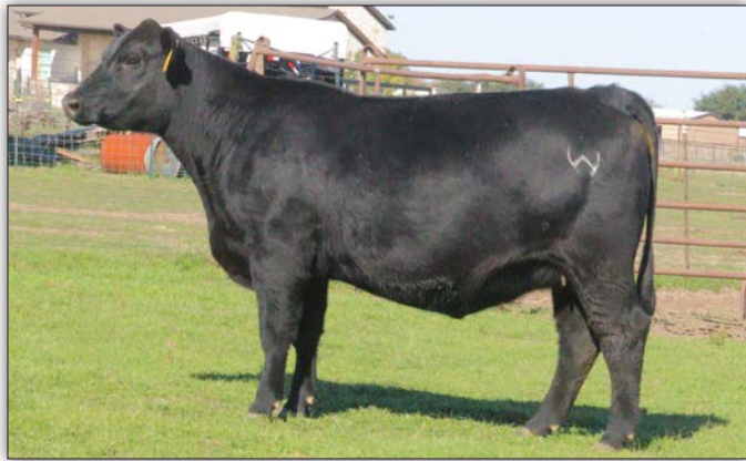
WILKS HENRIETTA 261 - LOT 44

Owned by Bent Tree Ranch 261 goes back to two big-time families on both sides; her sire is the $450,000 Home Town who is the heaviest-used sire in the breed and she comes from one of the most famous families we know to date, the Henrietta Pride family. 261 has very well-balanced EPDs with 15 traits in the top 15%. She is due to calve February 23, 2024, to HPCA Veracious.