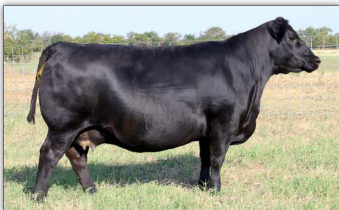
EXAR BLACKCAP 4349 - DAM OF LOT 8