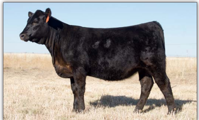
SV CATTLE WILDCAT 3003 - LOT 6

Owned by SV Cattle A daughter of the ultra-popular Wildcat that stems from the power donor 2 Bar Deaf Smith 2195, this female offers a huge growth spread from birth to yearling, along with elite marbling potential to help push her into the top 1% for $Beef and $Combined.