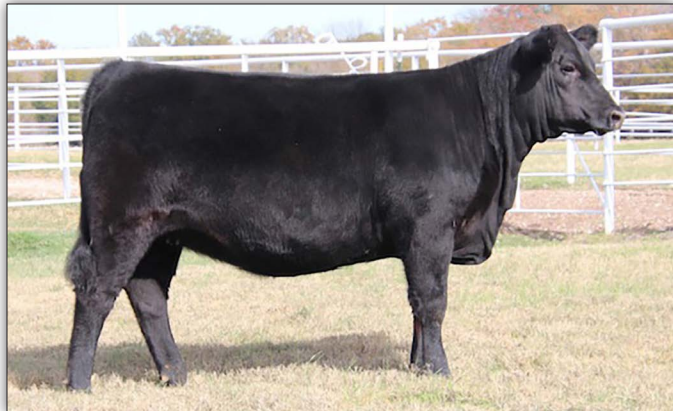
TMR EILEENMERE LASS L300 - LOT 13