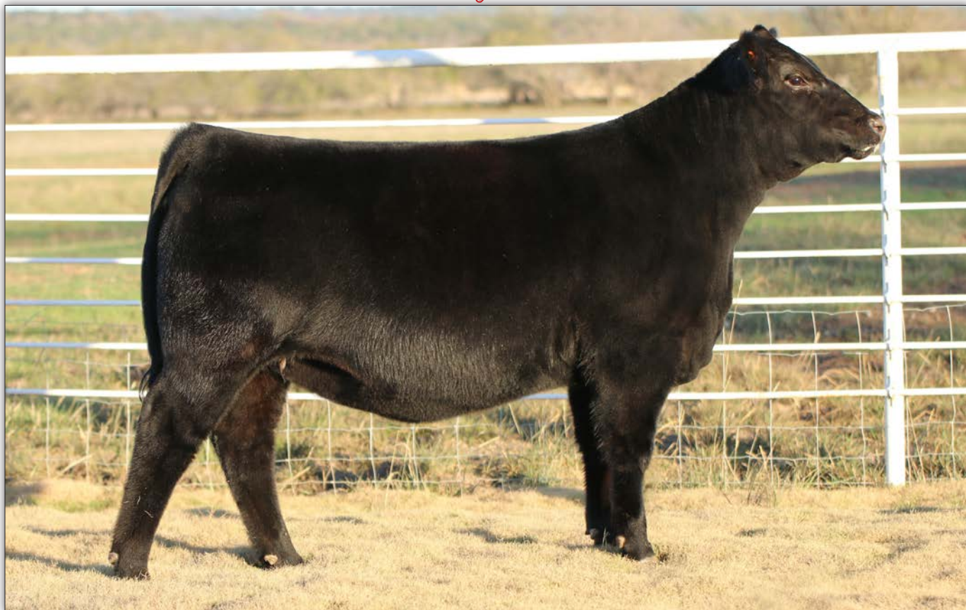
GABRIEL RITA 3206 - LOT 7