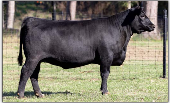
DIXIE HENRIETTA PRIDE 2520 - LOT 31A