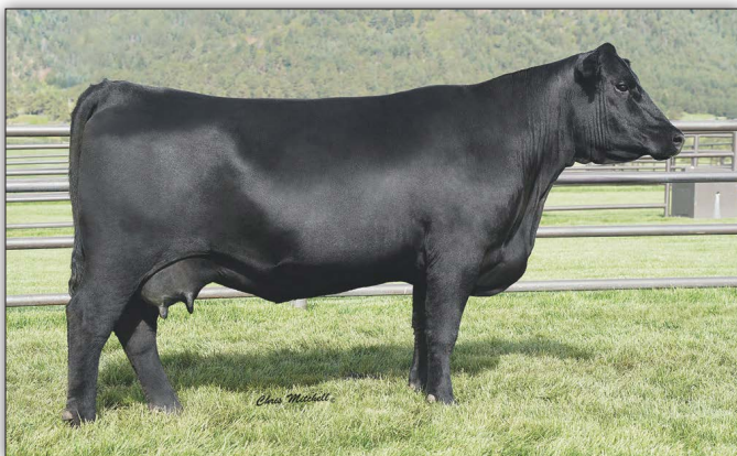
SPRUCE MTN WITCH 0054 - DAM OF LOT 5

Owned by Spruce Mountain Ranch Witch 3039 is a calving ease, high marbling and growth headliner from the famous Yon Witch family. A full sister to the dam of this female, Witch 0060 was a $56,000 valued selection of Warren G Farms and went on to produce, Witch 3010 the $110,000 valued 1/2 interest female selected by Deer Valley Farms in the 2023 Gobbell G3 sale and Witch 044, the $16,750 selection of Gobbell Farms from the first McWherter sale. This female has big time donor potential.