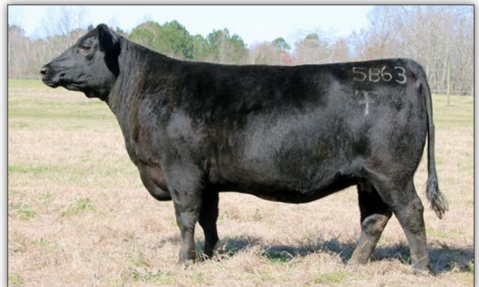
FF RITA 5B63 OF 356H 3S10 - DAM OF LOT 42