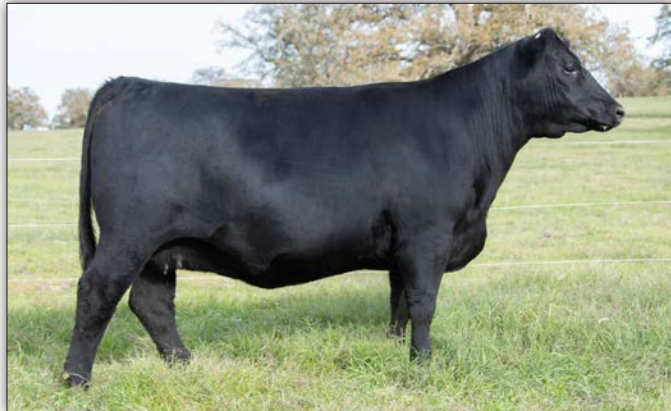
WSC LUCY G345 - LOT 41