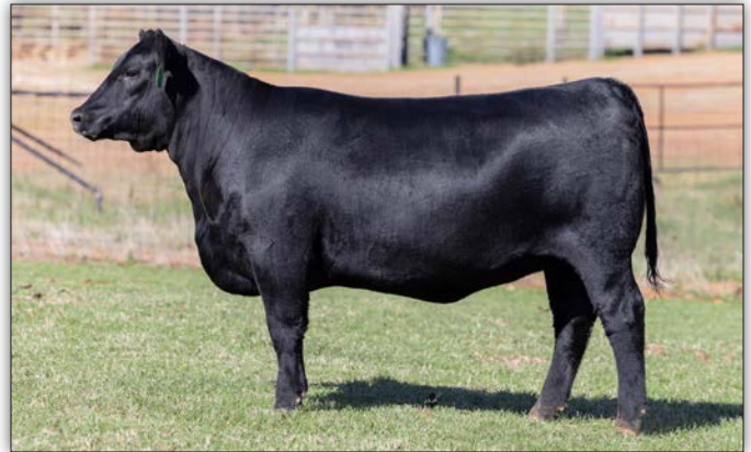
DIXIE HENRIETTA PRIDE 2525 - LOT 31C

• Offering three extraordinary flush sisters by Breakthrough that come from the $52,500 HR Henrietta Pride 7021 who is out of the $41,000 Dixie Farms donor Henrietta Pride 5080. All three of these sisters will sell bred to the scorching hot new feature at ST Genetics, Baldrige Heat Seeker H925.