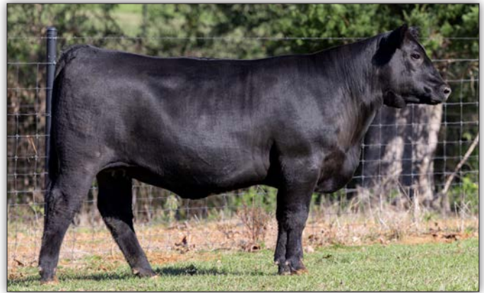
DIXIE HENRIETTA PRIDE 2527 - LOT 31B