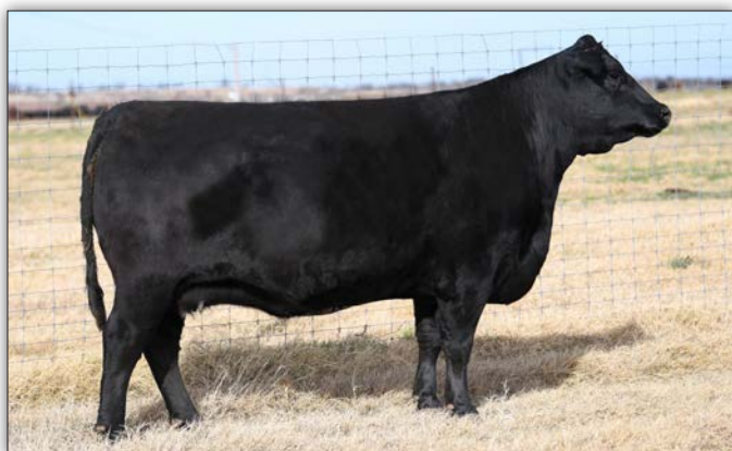
G A R CACHE 1740 - LOT 50

Owned by RA Brown Ranch Here is a royally-bred female that is stacked for generations with top AI sires and donor dams. Her elite EPDs rank in the top 1% of the breed for Marbling, $G, $B and $C, while also ranking in the top 10% of the breed for YW, Docility and REA. She is safe in calf to the only bull in the entire Angus breed that can match his 12 CED, 150 YW and greater than 1.60 for both Marbling and Ribeye, 241 $B and 379 $C, due April 28, 2024, to Brown Hometown 291K.