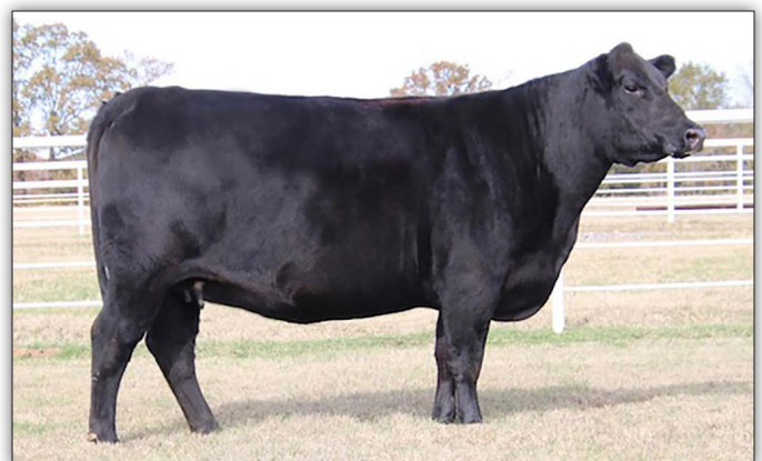
POLLARD EILEENMERE 9667 - LOT 53

Owned by Turner Meadow Ranch Eileenmere 9667 is the top-producing dam of Lot 13 in this event. This female has one progeny weaning ratio of 105 and ranks in the top 2% for $Beef, $Combined and RE, top 3% for $Feedlot, top 5% for $Grid, and top 10% for CW and Marb. She has been flushed 1 time for 8 viable embryos and is due to calve March 21, 2024, to Connealy Heroic 113L.