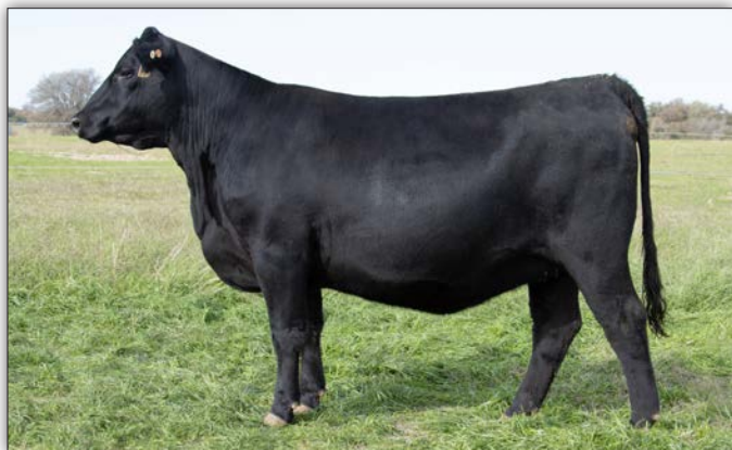
RMRK RITA 2356 - LOT 35

Owned by Rimrock Production Inc. An Iron Horse daughter back to the Rampage female that is a current donor in the Rimrock and Zybach programs. 2356 ratios 101 for weaning, 102 for yearling, 140 for IMF, and scanned a 10.5-inch ribeye at 737 pounds, showing she has the proven performance desired in today's cattle market. With performance and pedigree like this, and mated to the popular ST Genetics sire Poss Winchester, she puts together an excellent package. Bred to calve August 10, 2024, to Poss Winchester.