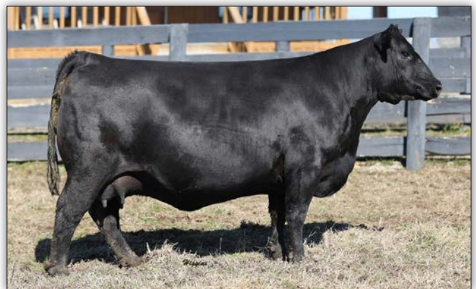
HR HENRIETTA PRIDE 7021 - DAM OF LOTS 31A, 31B, 31C

• Offering three extraordinary flush sisters by Breakthrough that come from the $52,500 HR Henrietta Pride 7021 who is out of the $41,000 Dixie Farms donor Henrietta Pride 5080. All three of these sisters will sell bred to the scorching hot new feature at ST Genetics, Baldrige Heat Seeker H925.