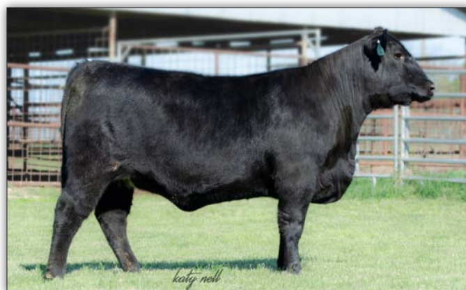
LCC HOLLYWOOD STORM 2900 - LOT 27