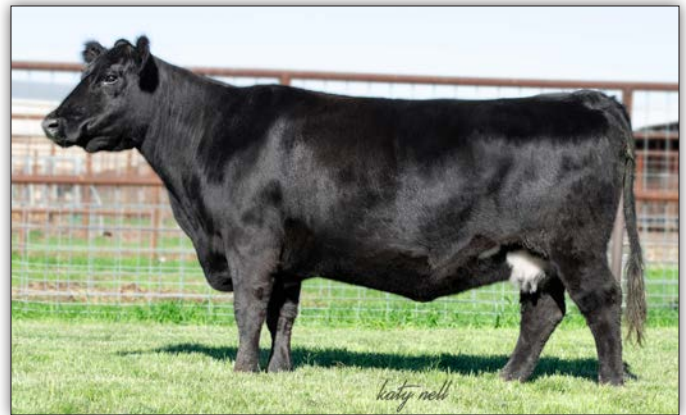
KAF 5007 ABSOLUTE E103 - LOT 59