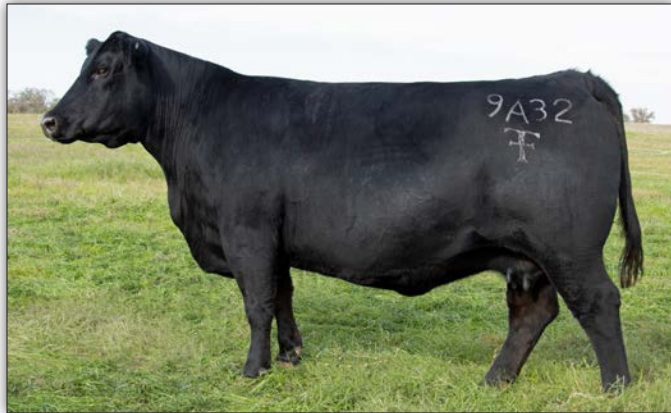
FF RITA 9A32 OF 5B63 ACCLAIM - LOT 42