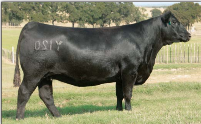
DEAN'S QUEENIE Y120 - DAM OF LOT 24

Owned by Buschmeyer Angus Farm Queenie 8575 is a bigger RE Black Magic daughter of the $600,000-valued Queenie Y120 who comes from the $105,000 cornerstone donor, Queenie 70527. This female has two progeny IMF ratios of 103 and offers added growth and ribeye potential. She sells with Lot 24A, a November 5 heifer calf (B113) by Riverbend Home Grown J615 that weighed 65lbs, AAA #20780000.