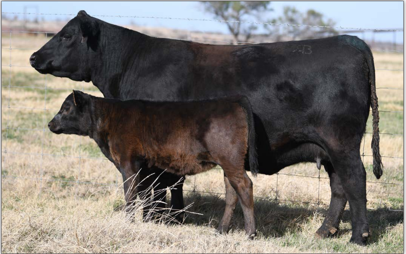
ZEBO PRIDE 2227 - LOT 21