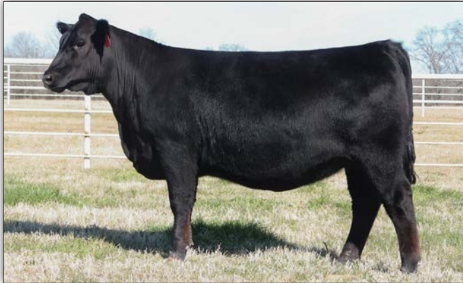
GABRIEL BARBARA 9749 - LOT 23

Owned by D'Hanis Angus Ranch Barbara 9749 is a powerfully-made Maverick daughter that stems from a granddam who is a $25,000 former Percy donor with $160,000 in progeny sales. This female offers an elite, well-balanced set of numbers and ranks in the top 5% for seven of the eight $Value Indexes. She sells with Lot 23A, a September 22 bull calf (3510) by Williams Hollywood that weighed 76lbs. She was AI-bred November 20 to E & B Wildcat.