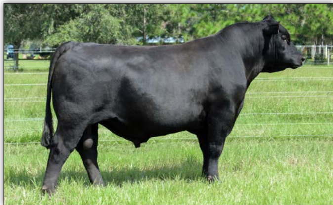
WILLIAMS B I G RIG - LOT 17

Owned by 7H Cattle and Steve Zybach Offering 20 straws of semen in increments of 5 out of Big Rig who was the top-selling bull in the 2023 Big Timber sale. This Home Town son rivals any of his paternal brothers in terms of power, growth and overall performance. This stud offers elite numbers across the board and impressively has all eight $Value Indexes in the top 5% with five in the top 1%.