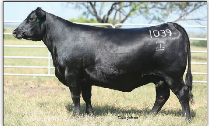
G A R 5050 NEW DESIGN 1039 - DAM OF LOTS 34A AND 34B

Owned by Hillhouse Angus The first of two flush sisters by Home Town and out of the famous Hillhouse and Peary donor, G A R 5050 New Design 1039, who has produced over $250,000 in progeny sales for those two programs. 2705 scanned 12.8% IMF to ratio 138 with a 12.5-inch ribeye to ratio 104. This female offers elite calving-ease and marbling potential in a complete package.