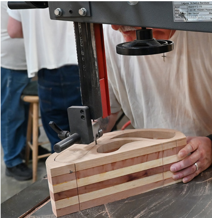
Using the band saw to carve salad bowls.