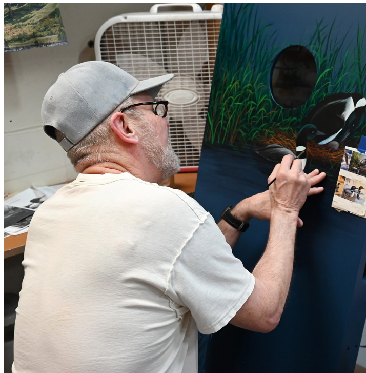
Painting corn hole boards.

you. We have Lean 101 classes that teach residents how to set up their work area in a productive way. This is the best part of the residents’ day. And those of us who work here really enjoy it. We’re watching residents learn and gain new skills for when they’re released. For those serving life sentences, this work gives them purpose and a positive focus. We treat each of them as a worker not an inmate. Everybody finds their niche here. If you’re a new worker we put you with a group of four other residents. We move residents to new challenges if they do well and want to do more.”