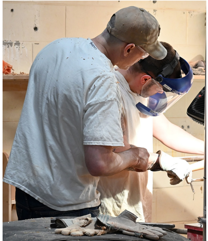
Skilled residents training others.

The entire facility is exceptionally organized, tidy and well run. Everyone is busy. Experienced workers are training new residents. Lindsey says, “If you’re willing to learn, there’s someone here that will teach