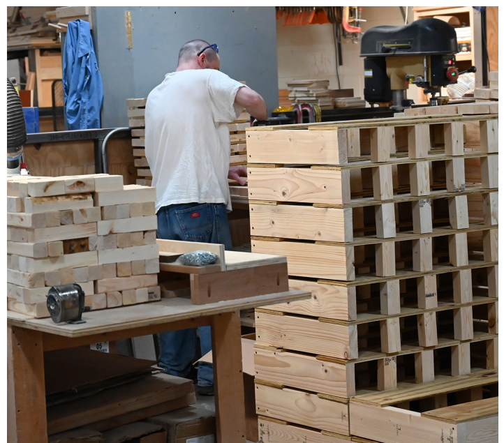
Residents at work at the Maine State Prison.