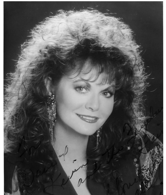
Jeannie C. Riley made famous by the song "Harper Valley PTA" performed on October 4, 1973 at Fryeburg Fair. Riley is now 71 years old and lives in Tennessee.

Jamey Johnson performed Fryeburg Fair's Night Show in 2009. He has received nine Grammy nominations and has won multiple country music awards.