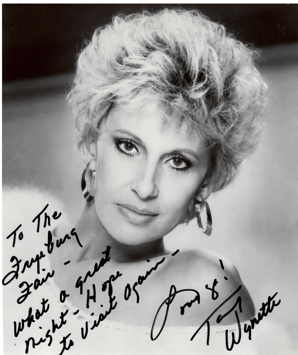
Fryeburg Fair History - Tammy Wynette (1942-1998) was the Night Show headliner in 1983. Wynette's photo, along with many others, hangs in the Fair's Entertainment Office.