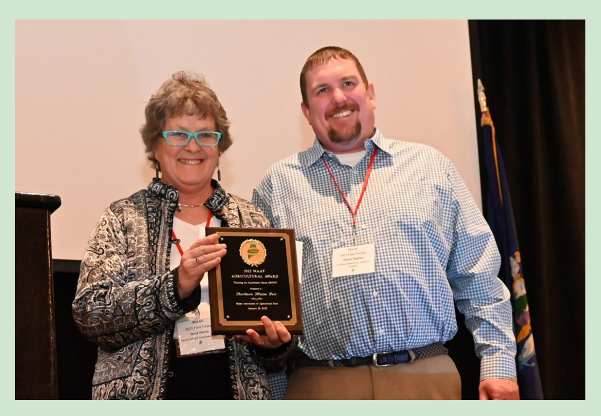
Congratulations to Northern Maine Fair and their project Lil' Loggers at the Fair. They were recognized for their outstanding forestry project involving children in a hands-on lesson about the importance of forestry in our northern Maine woods.

Congratulations to Litchfield Fair for their delightful Wheeler's Wee Farm project. In place for several years, Wheeler's Wee Farm introduces children to the many aspects of Maine farming. From the apple orchard through the lobster boat and chicken house to the "milking" cow, all were opportunities to become farmers for a moment.