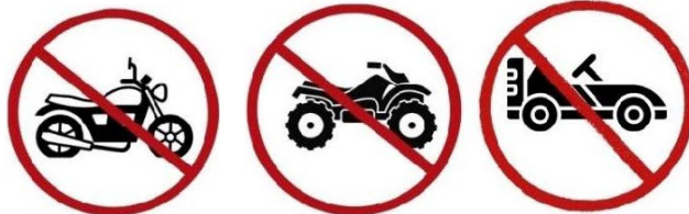
MOTORCYCLE OF ANY KIND