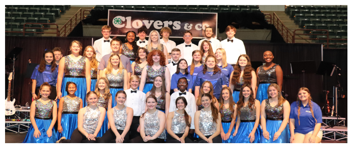
Clovers & Company at the 2022 Georgia National Fair

Clovers and Company represents the best performing talent in 4-H. Clovers members are selected through auditions annually. All 4-H'ers, age 9-19, are eligible. The group performs throughout Georgia and is nationally acclaimed, having performed from Chicago to Florida, and from Washington, D.C. to Alabama. The show is 45 minutes long and features singers, dancers, and a live band.