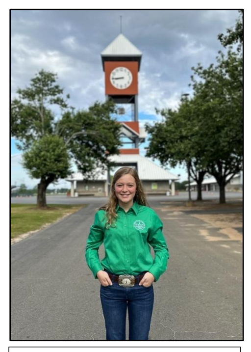
Kylianne Brown Hall Co.