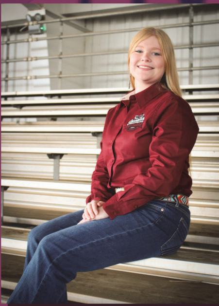
ALY CORZINE VETERANS HIGH SCHOOL