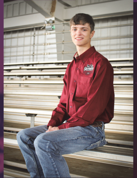
LEYTON MORRIS MORGAN CO. HIGH SCHOOL