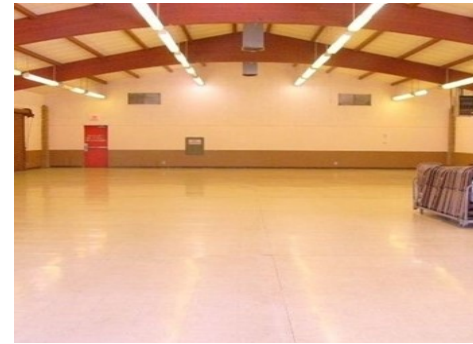
ARTS & CRAFTS EXHIBIT BUILDING

Kitchen facilities can be arranged for in another building for an additional charge.