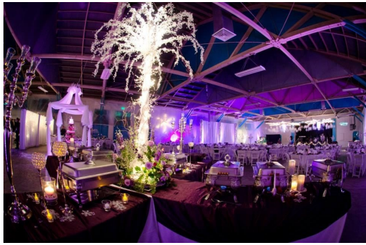
FLAHERTY EXHIBIT HALL

Size: 14,000 S.F. (190ft x 65ft) Capacity: 2,000 Theater, 933 Sit Down