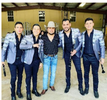
Sunday, Oct. 10 La Maquinaria Nortena