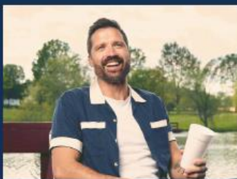
FRIDAY, OCT 15 WALKER HAYES WITH GABE LEE AND JACK INGRAM