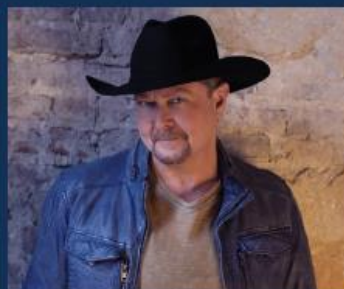
THURSDAY, OCT 14 TRACY LAWRENCE WITH CARSON JEFFREY