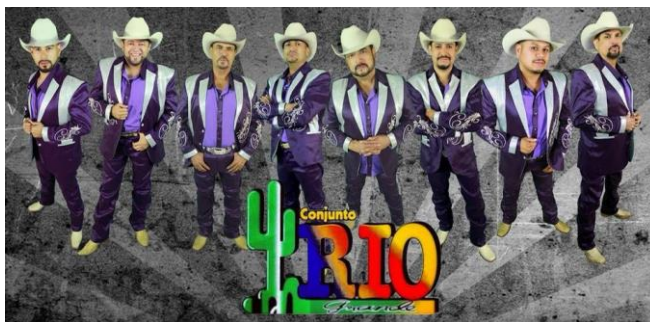
Sunday, Oct. 17 Conjunto Rio Grande