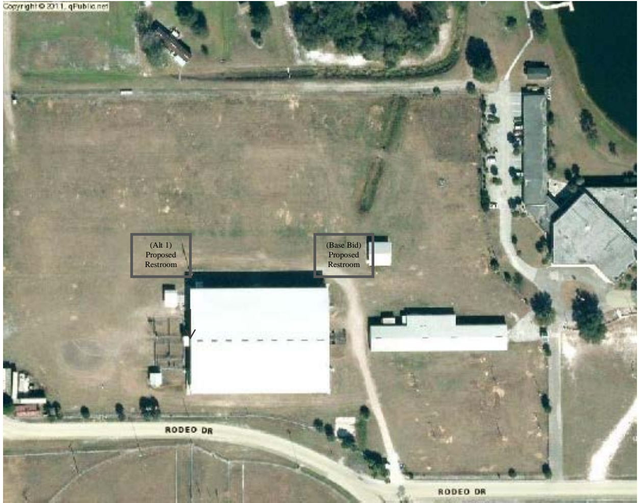
Exhibit 1-2 – Vicinity Map (not to scale)