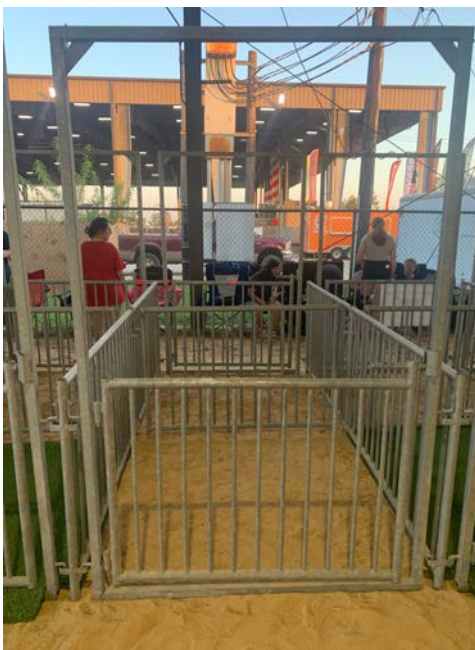
Goat Pens Example