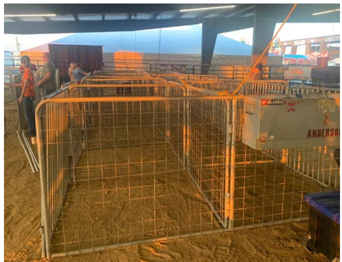
Lamb Pen Example