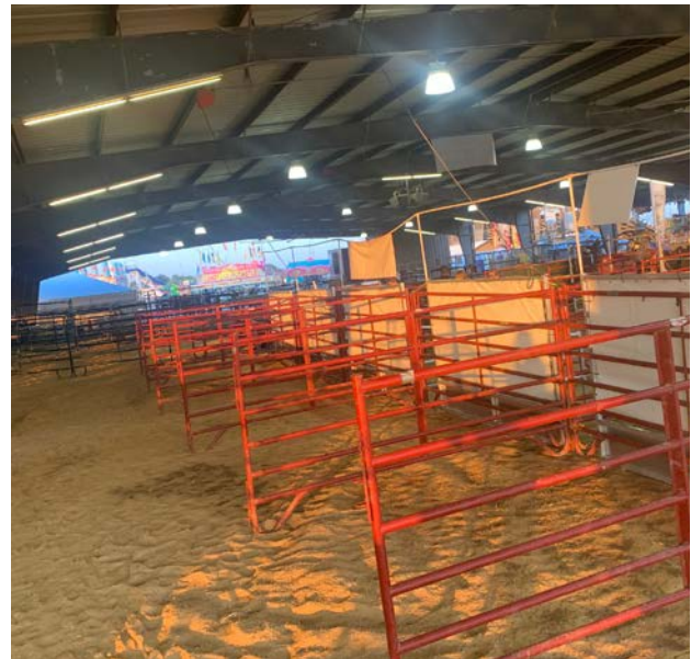
Cattle Panels Stall Space, Heifers could be along fence (with no panels)