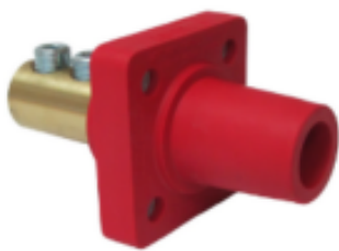
#1 - Cam Lock