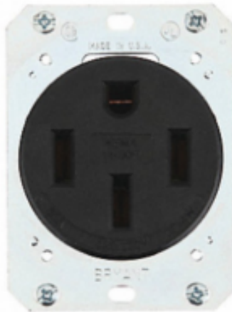
#2 - 50 Amp (Standard Dryer)