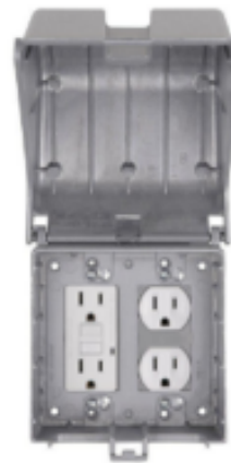
#3 - 20 Amp (110v/1)