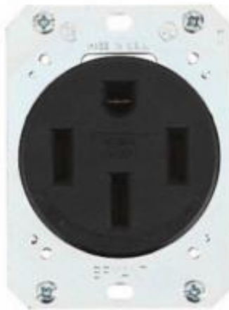
#2 - 50 Amp (Standard Dryer)