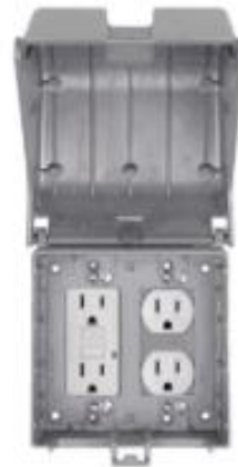
#3 - 20 Amp (110v/1)