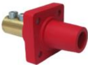
#1 - Cam Lock