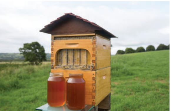
A honeybee colony can produce 30-60 pounds of honey in one year.