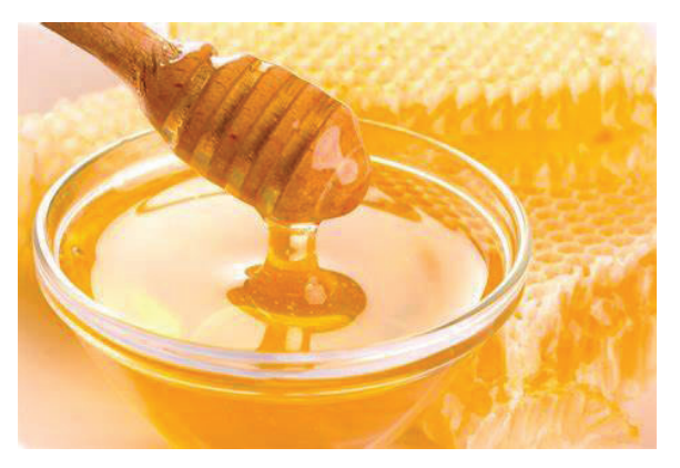
Honey is important as a food source for animals and humans, it has medicinal values, and can last for years.