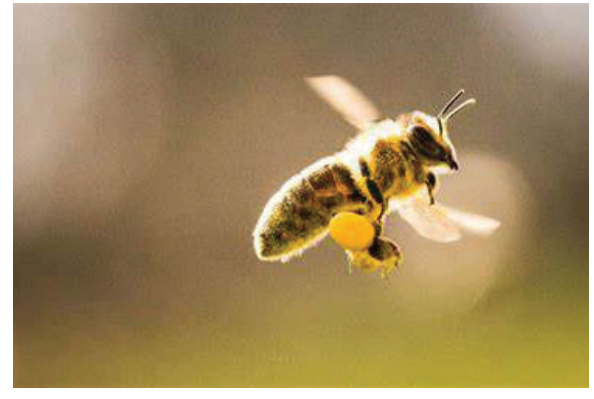
Pollinators help spread pollen to different places and to different plants.

Honeybees must gather nectar from two million flowers to make one pound of honey. One bee would therefore have to fly around 90,000 miles - three times around the globe - to make one pound of honey.