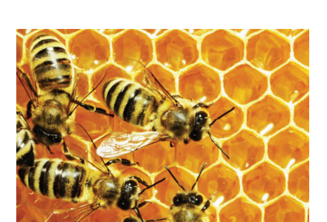
It takes 3-4 weeks for bees to start producing honey from a new hive.