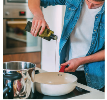
Consumer purchases oil to use when cooking a variety of food dishes.