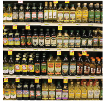
Oil arrives at the grocery store.