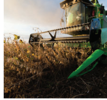
Soybeans are harvested from the plant in September.