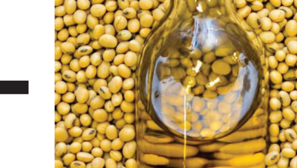
Oil is made as a by-product of soybeans.