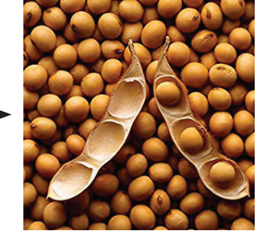
Seed is planted in the first three weeks of May.