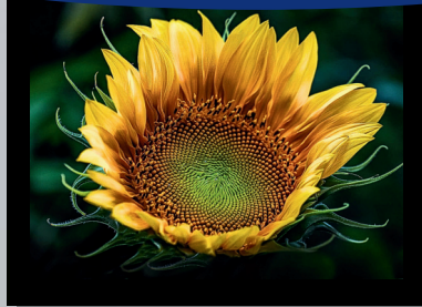
Add description here