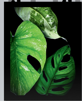
Add description here

JOSEPHINE COUNTY FAIR OFFICIAL EXHIBIT GUIDE