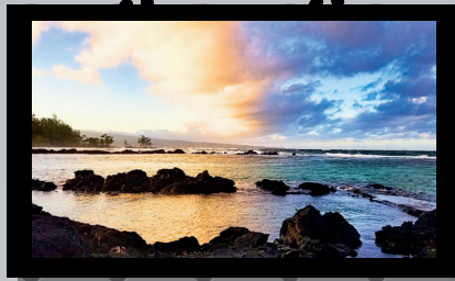
Add description here