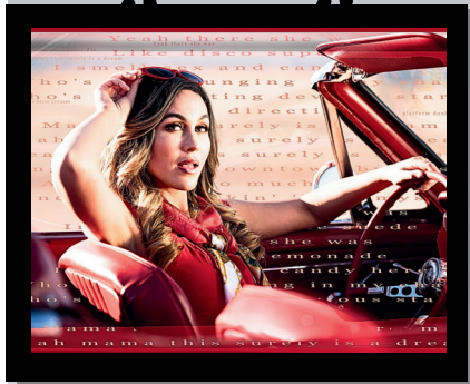
Add description here