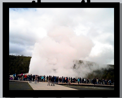
Add description here