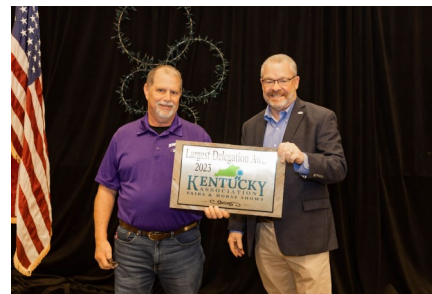
2023 Largest Delegation Award: Boone County