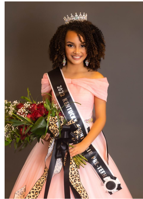
2022 Miss Pre-Teen Kentucky County Fair

T6 Contestant must be 13 years of age on October 31, and cannot be 16 on October 31 of the year when the local pageant is held at the local fair.