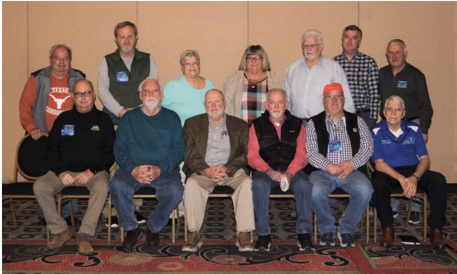
Past presidents at the 2023 KAFHS convention