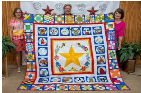
Cibolo Creek Quilters