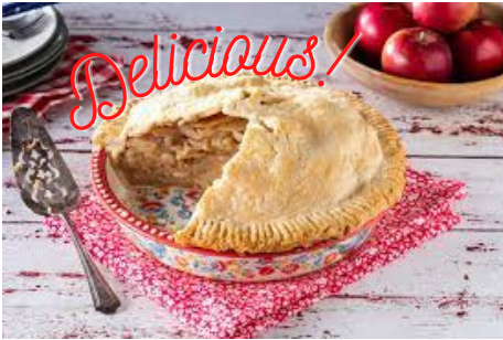
People's Choice Eddie Onoford