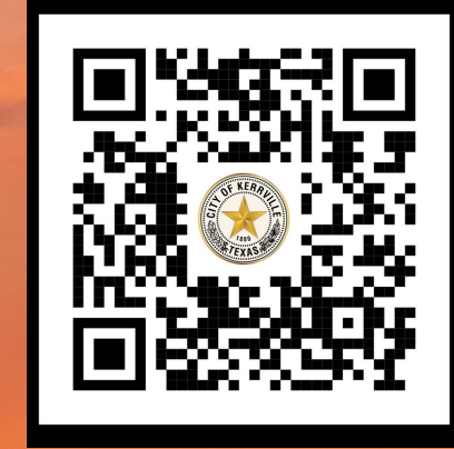
For additional information go to kerrvilleeclipse.com