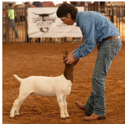
2022 Lea County Fair Junior Livestock Department