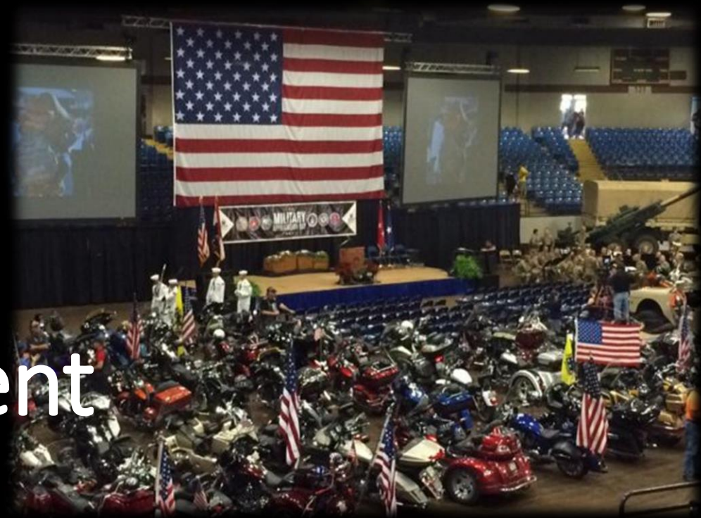
Military Appreciation Day