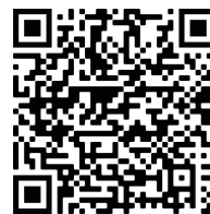
EXHIBIT HALL RULES

12. ALL STATE RULES APPLY, visit maderafair.com to view or SCAN BELOW: