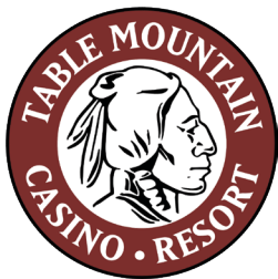
TABLE MOUNTAIN CONCERT SERIES