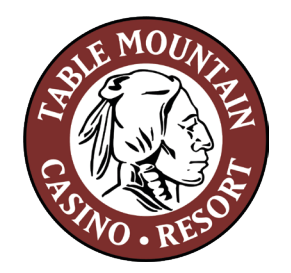
TABLE MOUNTAIN CONCERT SERIES

presented by ESTRELLA JALISCO ALL FREE WITH PAID GATE ADMISSION