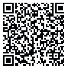
EXHIBIT HALL RULES

12. ALL STATE RULES APPLY, visit maderafair.com to view or SCAN BELOW: