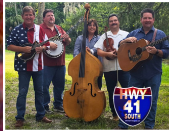
HWY 41 SOUTH