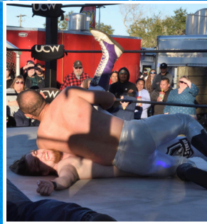
Universal Championship Wrestling