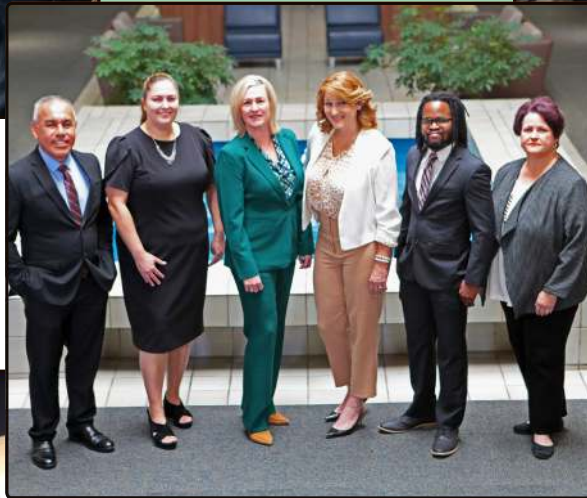
The CVB team is an integral part of the Economic Development team.