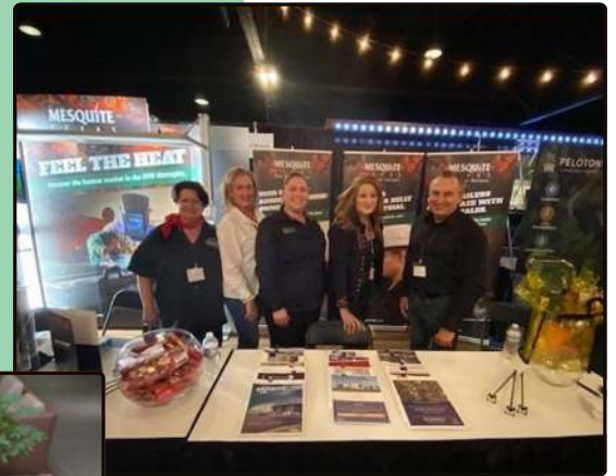
The CVB team participates at the North Texas Commercial Association of Realtors Expo.