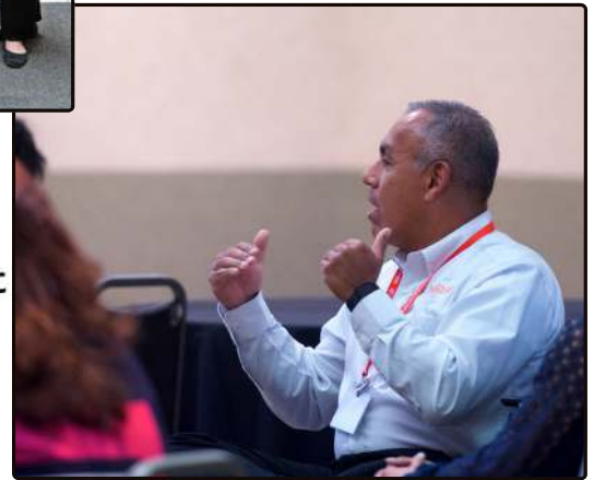
The CVB Team earns continuing education credits toward their Texas Destinations Marketer certification.