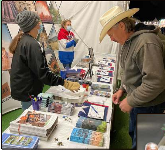
The CVB team joins Team Texas for the Albuquerque Balloon Festival.