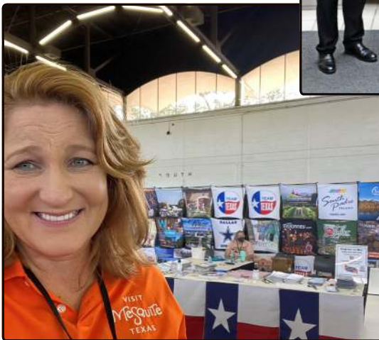
The CVB team joins Team Texas at the Dallas Travel and Adventure Show resulting in a business lead and site tour.