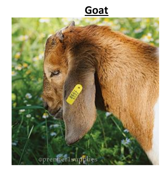
Tag # on inside of ear Use opposite ear as scrapie tag