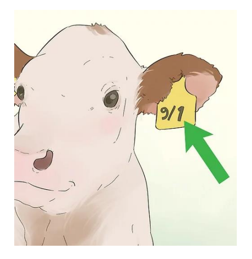
Tag # on inside of ear