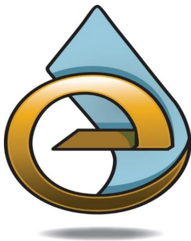
EXHIBIT DATES: August 13-17, 2026