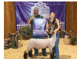
2023 GRAND CHAMPION LAMB