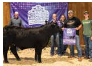
2023 GRAND CHAMPION BEEF STEER