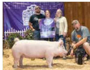
2023 GRAND CHAMPION HOG