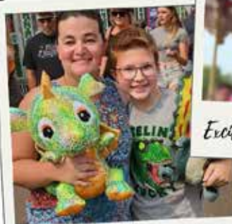
Fun with Family!