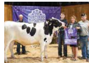
2023 GRAND CHAMPION DAIRY STEER