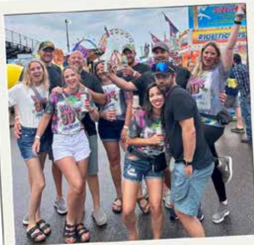
Best Summer Ever!

Tag Northern Wisconsin State Fair in your photos online for the opportunity for your memories to be shared in upcoming promotions!