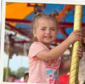
Exciting Carnival Memories!