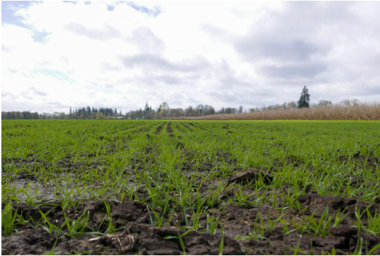
Benton County on March 30, 2023.