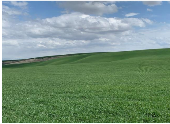
Club Wheat in Umatilla County on April 17, 2023.