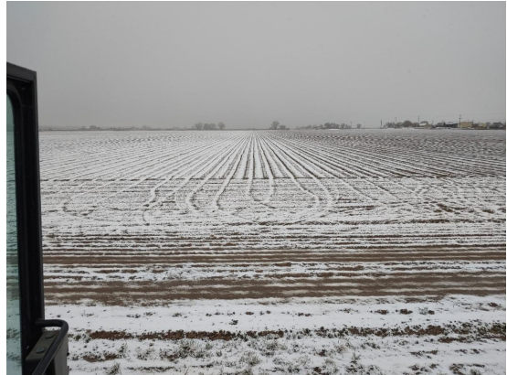
Field conditions in Malheur County on April 18, 2023.