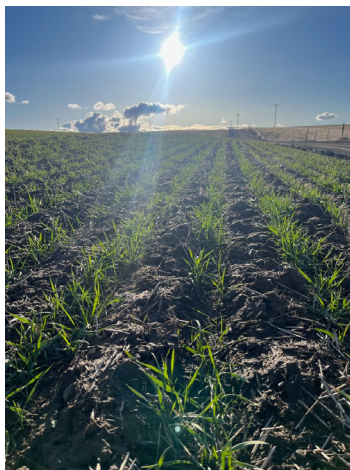
Soft white winter wheat in Sherman County on March 29, 2023.

In March and April, Oregon received additional moisture, providing an overall benefit to the crop in most regions of the state. Both months have been characterized by extended cool weather, including snow into mid-April for certain parts of the state. Given the cooler weather, spring work was delayed. As it warms up and there are longer growing days, the work will advance quickly.