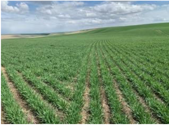
Club Wheat in Umatilla County on April 17, 2023.