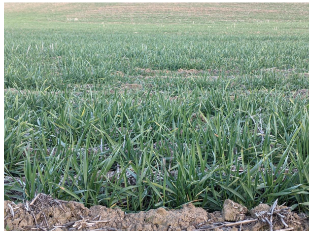
Soft white winter wheat in Wasco County on March 30, 2023.