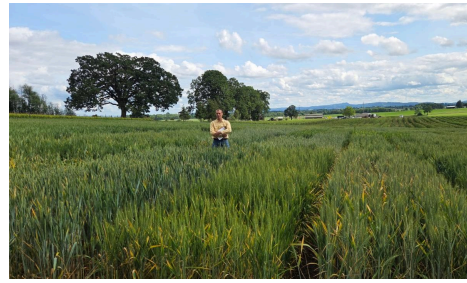
Winter wheat variety trials in Washington County on May 19, 2026.