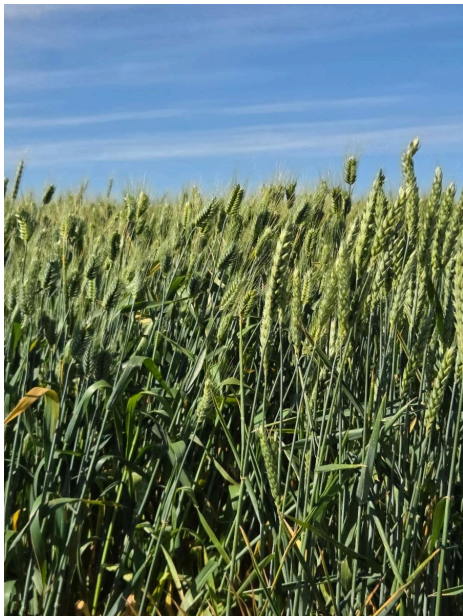
Soft white winter and club wheat in Sherman County on June 2, 2026.

Beneficial rains and cooler weather at the end of May supported the Oregon wheat crop development at a critical juncture. Winter wheat headed as of May 31, 2026 was at 95%, which is ahead of the five year average of 72%.