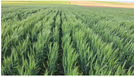
Soft white winter wheat in Morrow County on May 13, 2026.