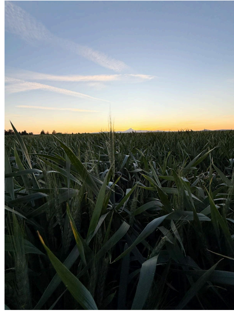
Soft white winter wheat in Wasco County on May 12, 2026.