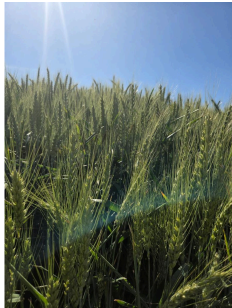
Soft white winter wheat in Wasco County on June 2, 2026