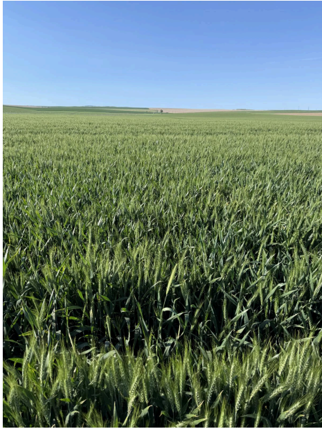
Soft white winter wheat in Umatilla County on June 2, 2026.