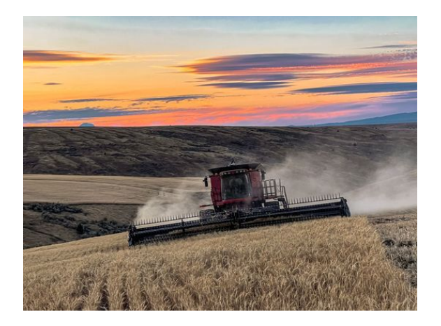
Sherman County, Soft White Winter Wheat, July 27, 2023