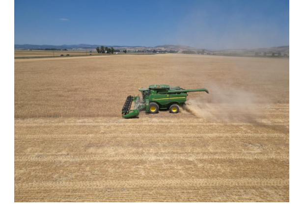
Union County, Soft White Winter Wheat, July 28, 2023, Photo Credit: Wade Bingaman

Yamhill County, Spring wheat, July 26, 2023, Farm: Bruce/Helle Ruddenklau