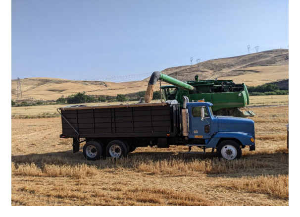
Wasco County, Soft White Wheat, July 6, 2023