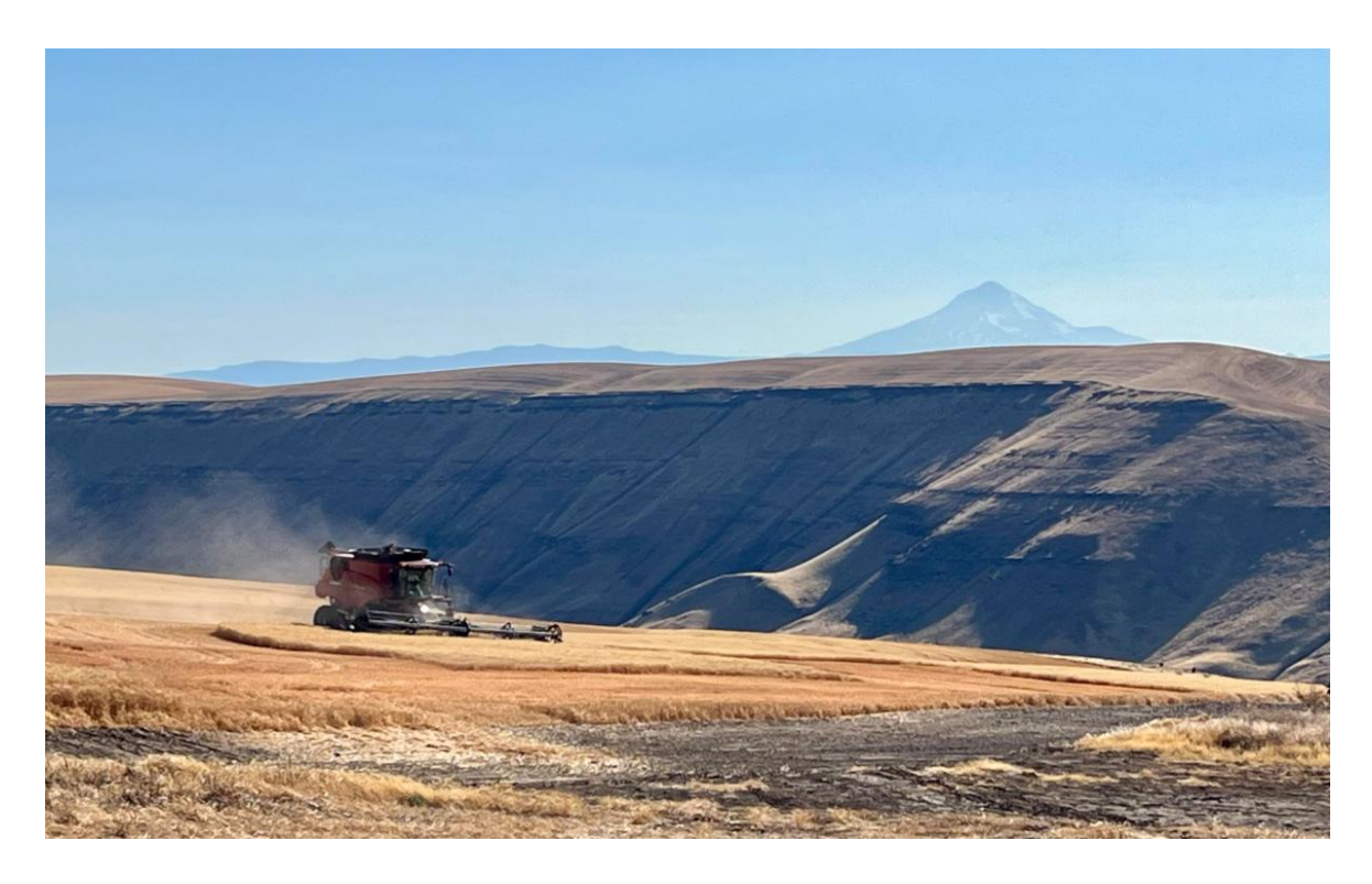
Sherman County, July 11, 2023

Oregon officially started harvest at the end of June. Heat continued to accelerate Oregon's wheat crop development over the past few weeks. A number of producers in the dryland North Central portion of the state are now underway harvesting hard red winter and soft white winter wheat, with more expected to start harvest this week.