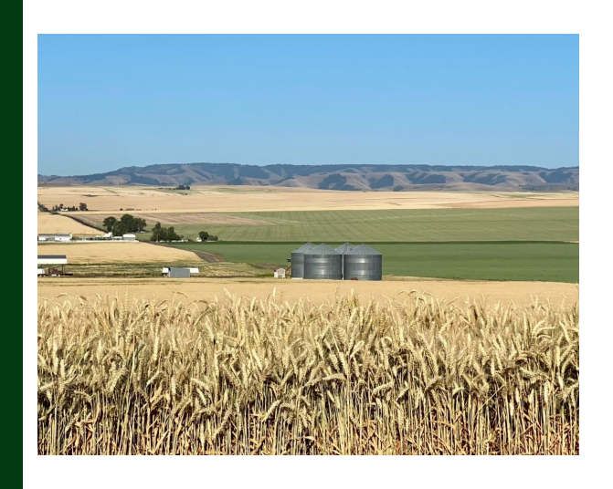
Umatilla County, July 1, 2023, Soft White Wheat