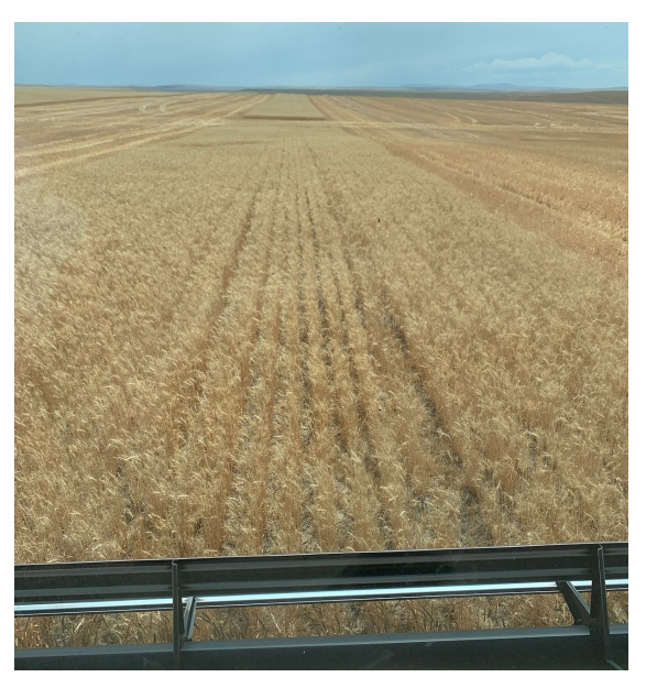
Morrow County, June 28, 2023, Hard Red Winter Wheat.