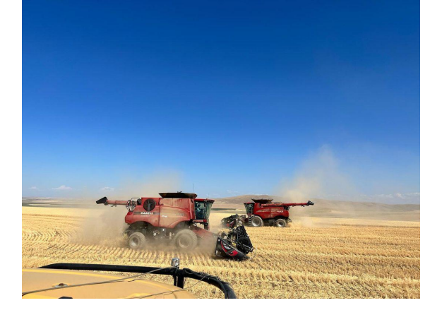
Morrow County, June 30, 2023. Nelmar Farms and EB Orem Farms