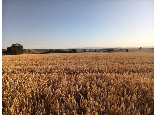
Soft white winter wheat in Malheur County on July 1, 2025.