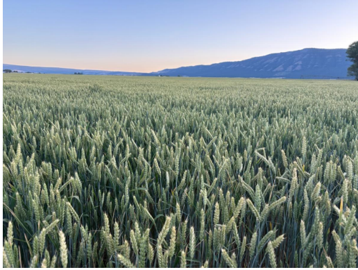
Soft white winter wheat in Union County on June 29, 2025.