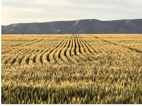
Soft white winter wheat in Wasco County on June 12, 2025.