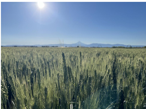
Soft white winter wheat in south Wasco County on June 8, 2025.

The crop began to turn quickly in June with warm weather. The moisture base in the soil helped support much of the winter wheat crop during higher temperatures, but the spring wheat crop faced challenges. With the warm temperatures accelerating the crop development, a few wheat producers have just started to get in the field. Oregon wheat harvest is therefore officially underway, but it will take a few weeks for much of the state to be fully in harvest.