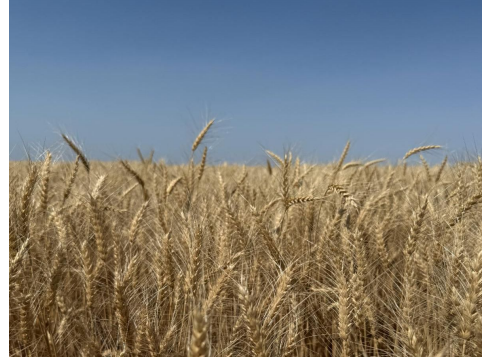
Soft white winter wheat in Morrow County on June 23, 2025.