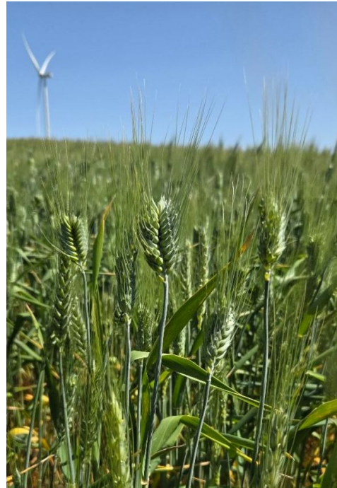
Club wheat in Sherman County field trials on June 4, 2025.