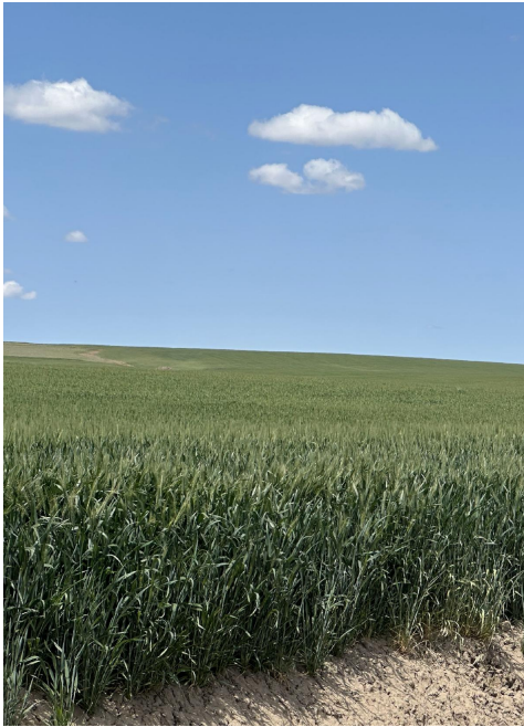
Soft white winter wheat in Gilliam County on June 3, 2025.