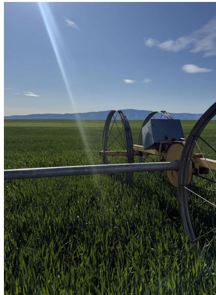
Soft white winter wheat in Union County on June 2, 2025. Reflecting irrigated wheat.