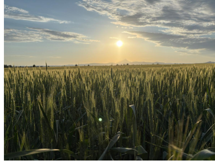
Soft white winter wheat in Wasco County on May 28, 2025.