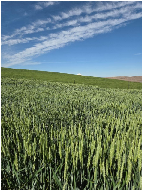
Soft white winter wheat in Wasco County on May 31, 2025. Reflecting two varieties.

Beneficial rains in May supported the Oregon wheat crop development, as reflected in the USDA ratings, which are improved from a year ago during this same time period. Winter wheat headed as of June 1, 2025 was at 88%, which is ahead of the five year average of 74%.