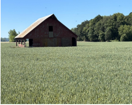
Soft white winter wheat in Lane County on June 2, 2025.