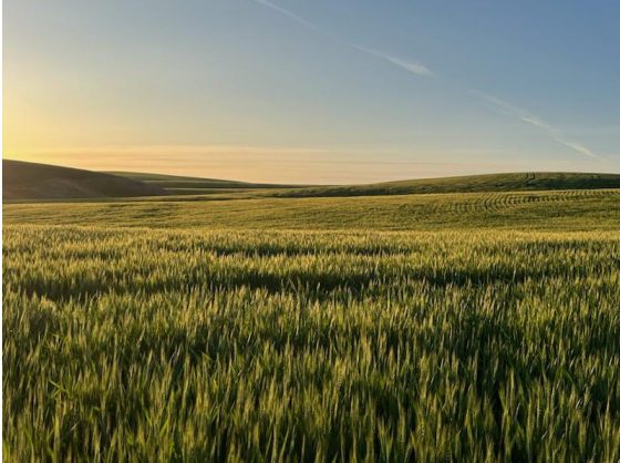
Umatilla County Soft White Winter Wheat, May 23, 2023