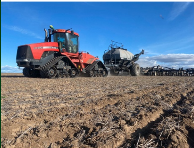
Sherman County, April 24, 2023

In May, the weather warmed considerably, with some areas experiencing well above average temperatures. Precipitation was mixed around the state. Spring wheat planting finalized, with the ability to get out into the field. Some winter wheat is beginning to head out, but progress remains behind average due to the extended cool weather in prior months.