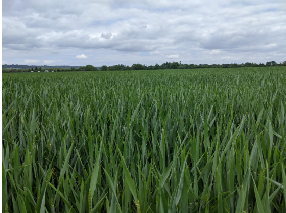
Washington County, Soft White Winter Wheat, May 23, 2023