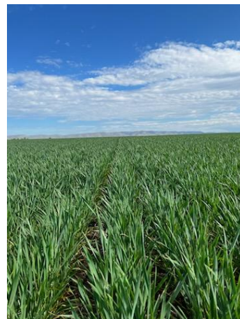
South Wasco County, Soft White Winter Wheat, May 16, 2023, Photographer: Josh Duling